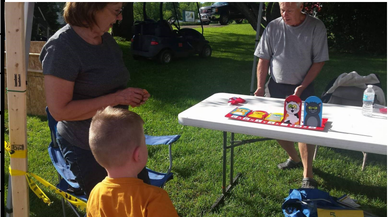
Our young campers had a great time at the Kid's Carnival!