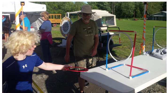
An expert shot at the Kid's Carnival!