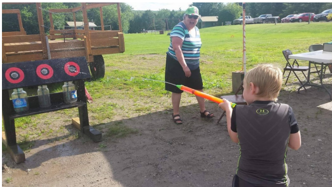
Having a great time at the Kid's Carnival!