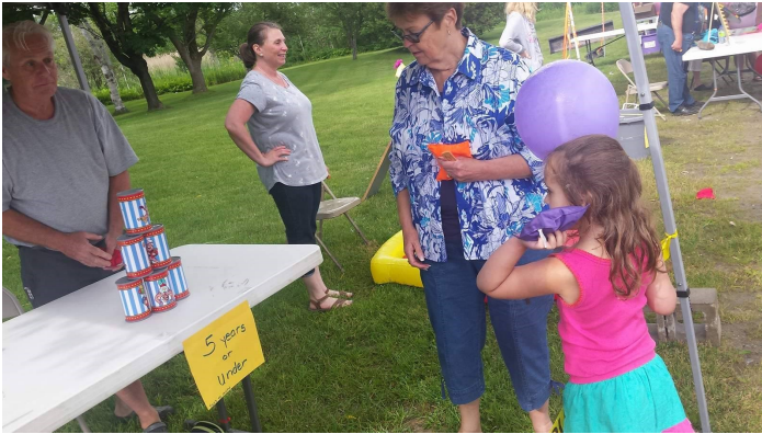
A young camper trying her luck at a carnival game!

the week of July 17 th . This will be your summer reading for power used from May 9 th until the day we read that week. If you are not sure if you have paid your opening bill, please see Theresa at the office she will be glad to help you.