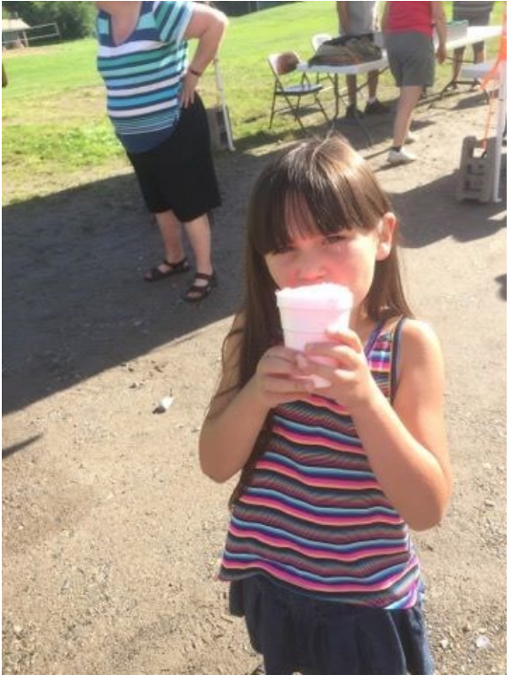
Someone enjoyed their snow cone at the Kid's Carnival!

We ask any camper that has a boat, canoe, kayak, or paddle boat at either of the boat launches that they tag the boat with their name. Our team would like to keep the launches mowed and trimmed but do not want to damage anyone's property while trimming. Having names on the watercraft would allow us to contact the owner to get them moved.