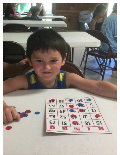
One of our campers enjoying Kid's Bingo!

10:00 am: Adult Softball - Everyone is welcome.