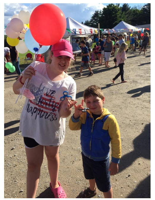
A great time was had by all of our young campers at the Kid's Carnival!