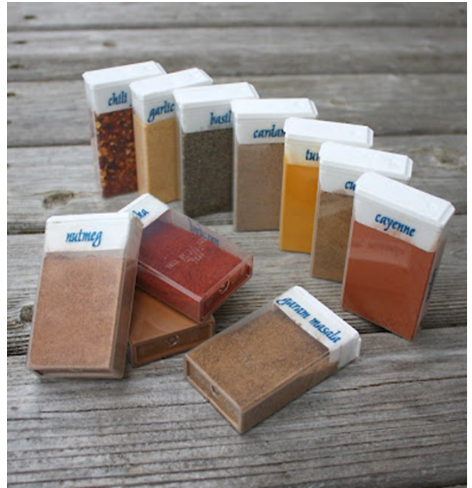
To save space use Tic-Tac boxes to store spices.