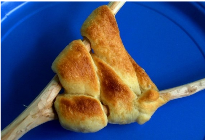
Make crescent rolls over the campfire. For maximum yumminess, fill 'em with stuff like marshmallows and Nutella. Or wrap hot dogs with them.