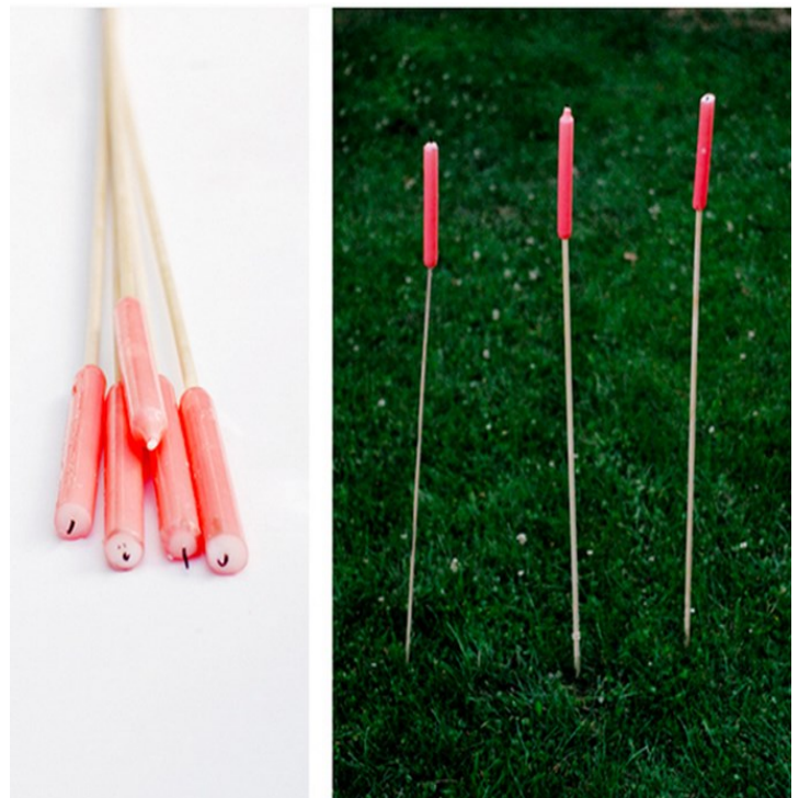
Make candle stakes for romantic nighttime lighting.