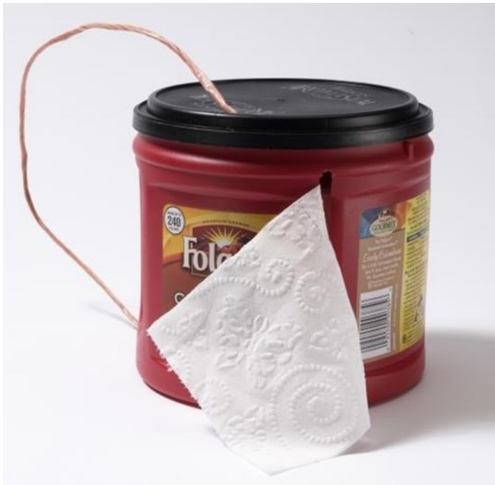
Repurpose a coffee can to hold and protect toilet paper.