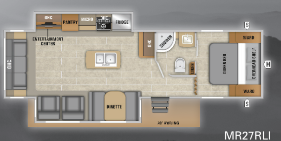
Length (pin to rear): 33'10" Ext. Height: 133" Unloaded Wt. (lbs.): 7,145