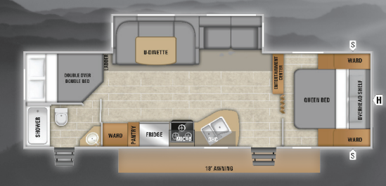
MR27BHS Length (pin to rear): 31'9" Ext. Height: 135" Unloaded Wt. (lbs.): 6,265