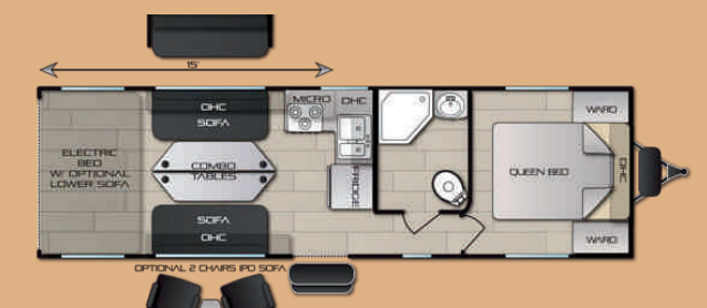
SANDSPORT TOY HAULER 28EX