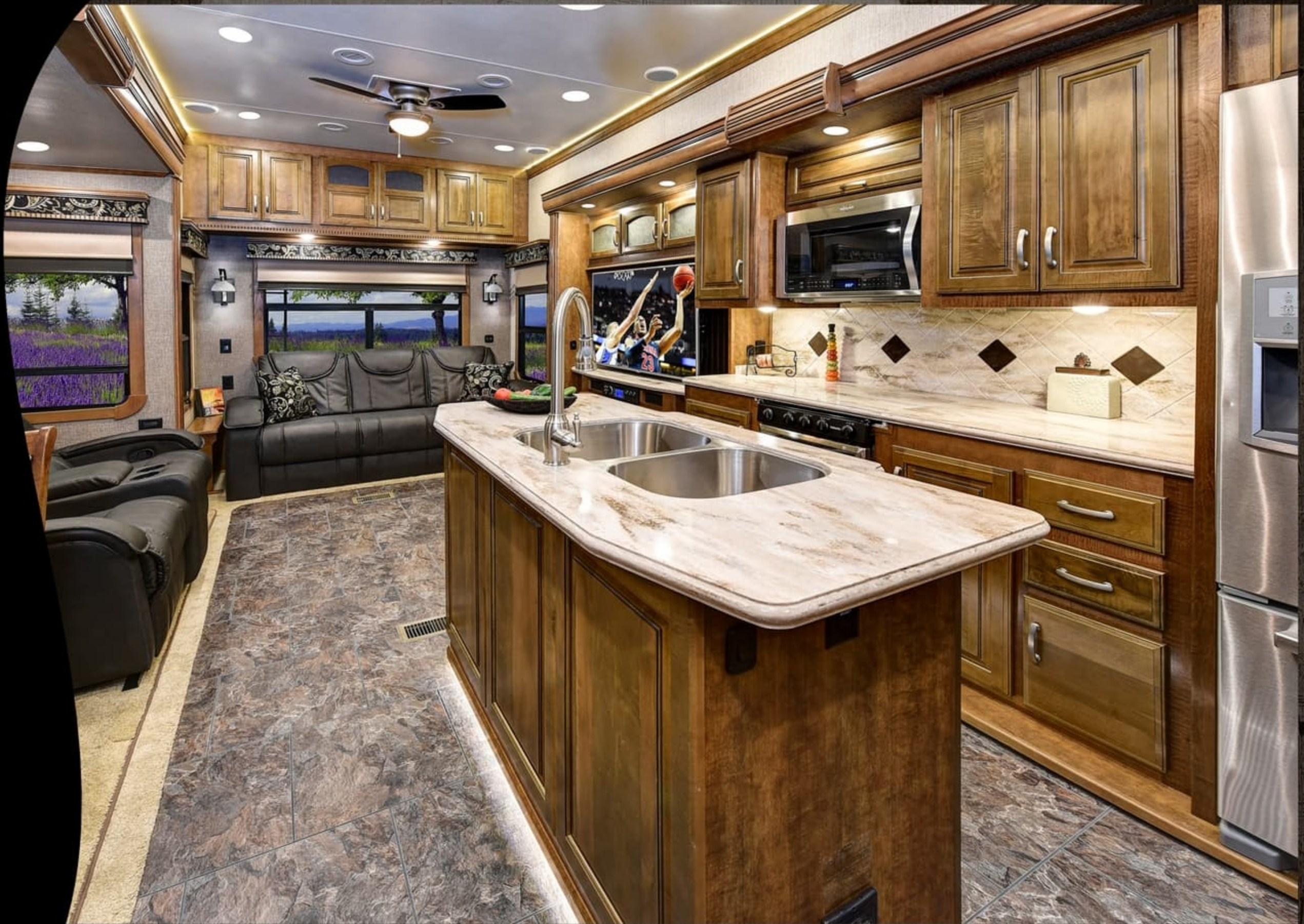
38SB Gourmet Kitchen & Living Area