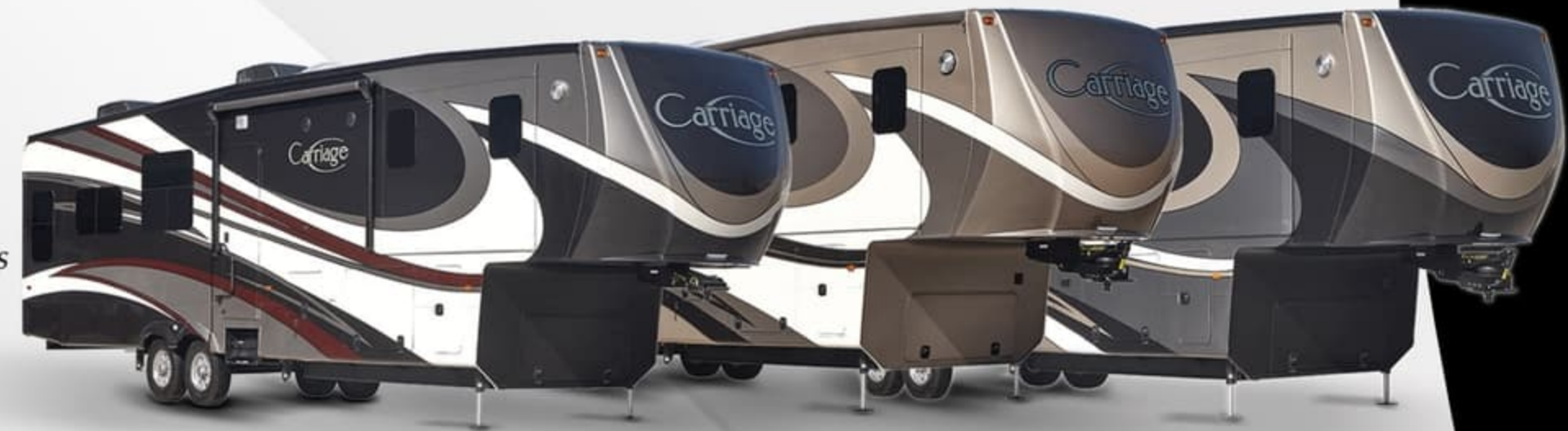
38SB Bedroom King Bed w/ Dual Slides & Night Tables

Carriage offers 3 paint schemes, allowing you more customization to fit your particular taste.