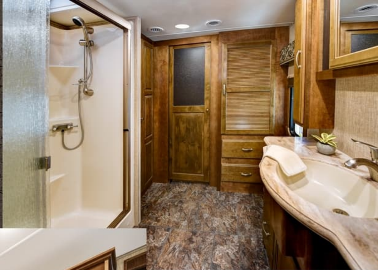
39FB Spacious Main Bath Connected to Master Suite