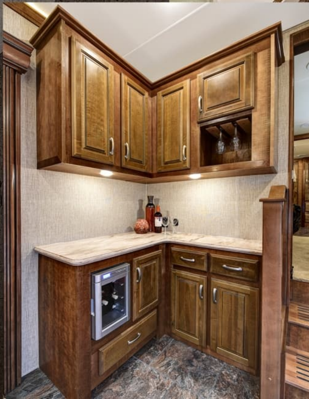
Opt. 39FB Butler Pantry w/ Wine Cooler & Stemware Rack

No other brand combines industry-leading construction, luxury amenities, maximum storage, and design-inspired decors like Carriage.