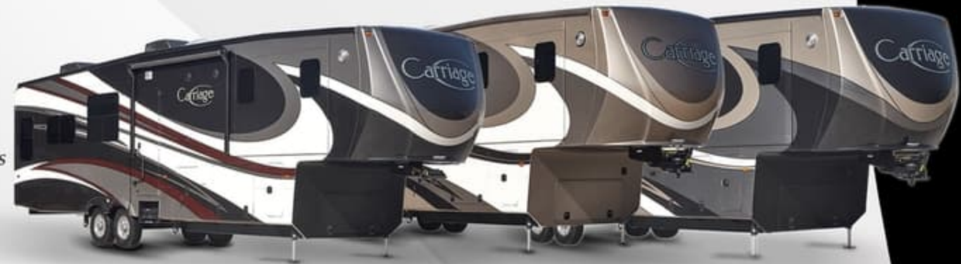
38SB Bedroom King Bed w/ Dual Slides & Night Tables

Carriage offers 3 paint schemes, allowing you more customization to fit your particular taste.