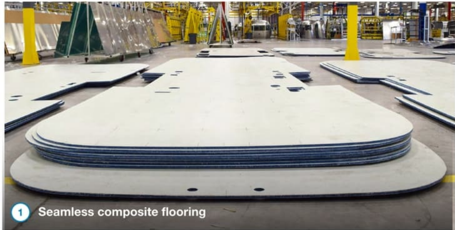
1 Seamless composite flooring