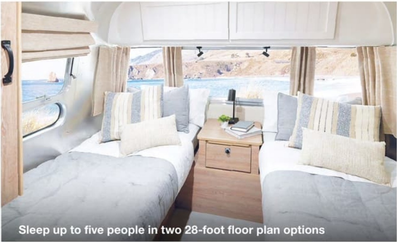
Sleep up to five people in two 28-foot floor plan options