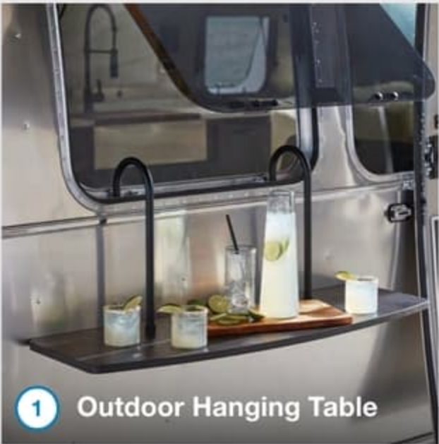
1 Outdoor Hanging Table

The perfect place to enjoy a cocktail with friends