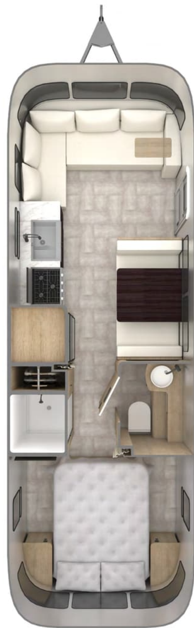
28RB Weight: 6,825 Exterior Length: 28' 2"

“ We love the little surprises – from the hidden table inside the sofa arm to the soft goods package that adds comfort and style to an already gorgeous trailer.” VICKI AND MELIDA POTTERY BARN 28RB Owners