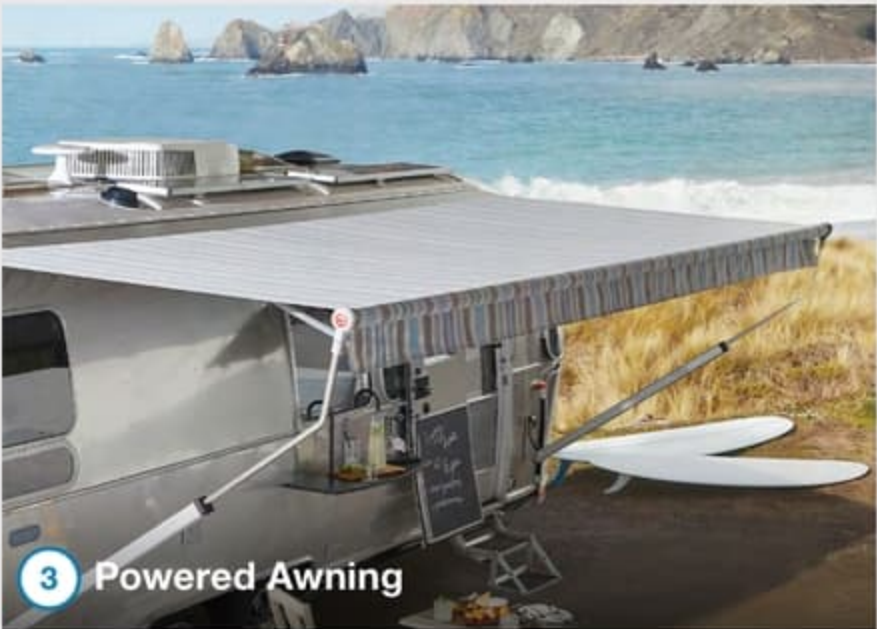
3 Powered Awning

Pottery Barn commemorative exterior badging