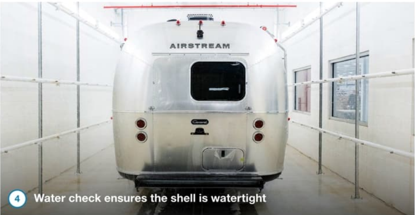
4 Water check ensures the shell is watertight