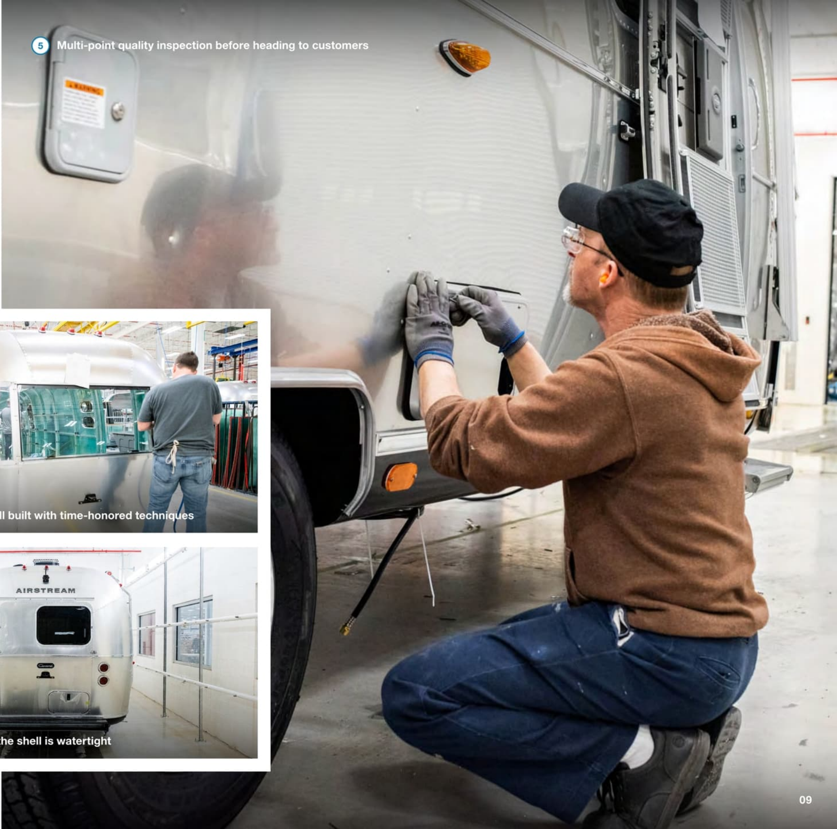
5 Multi-point quality inspection before heading to customers