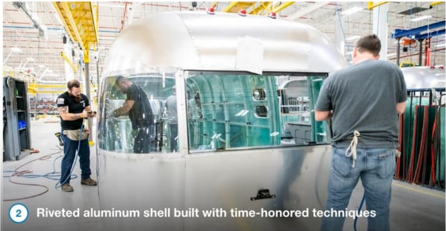
2 Riveted aluminum shell built with time-honored techniques