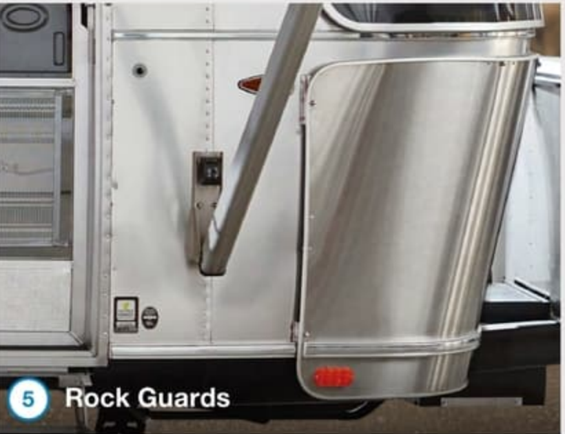
5 Rock Guards

Quickly cool the interior in relative silence