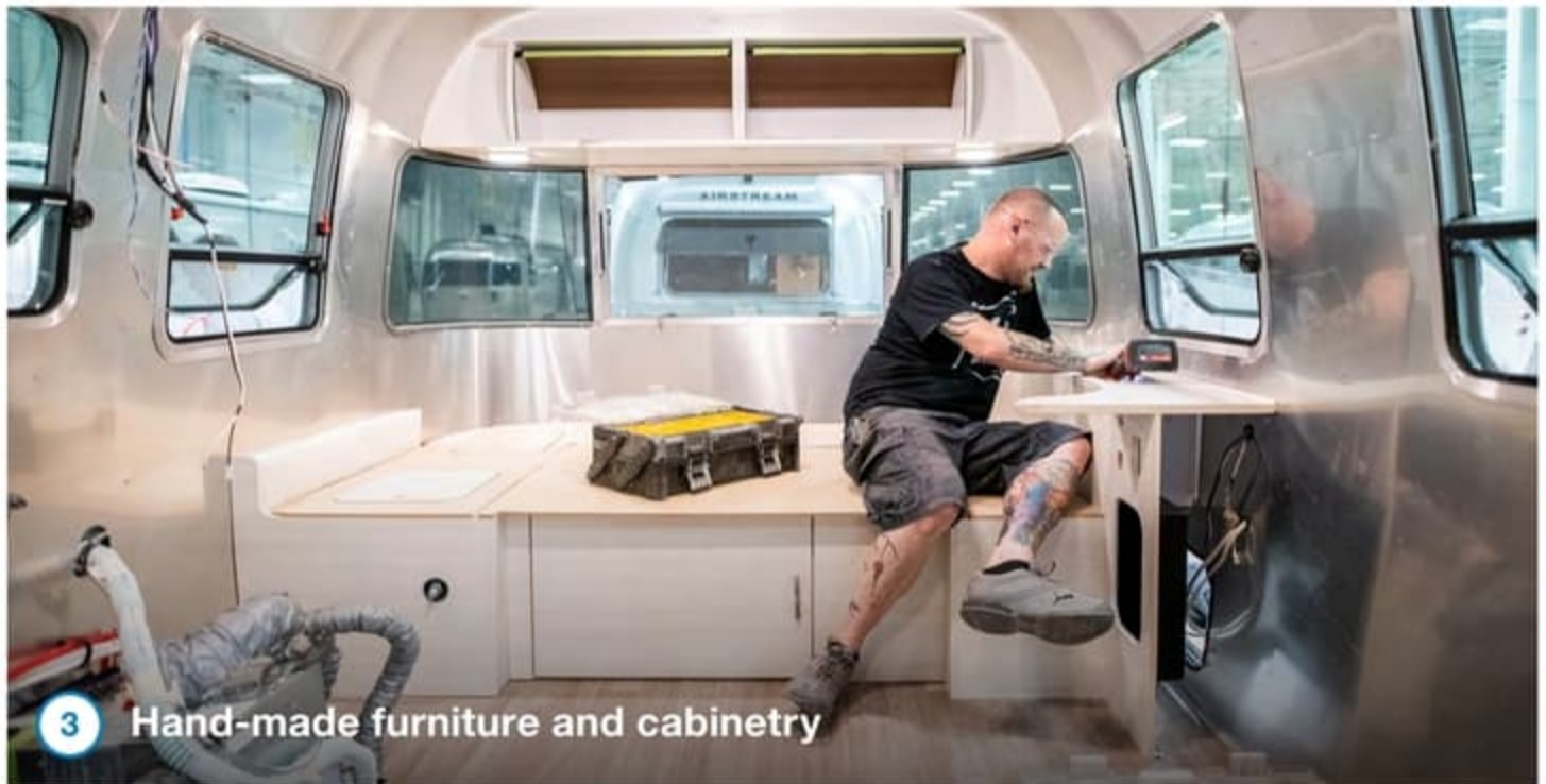
3 Hand-made furniture and cabinetry