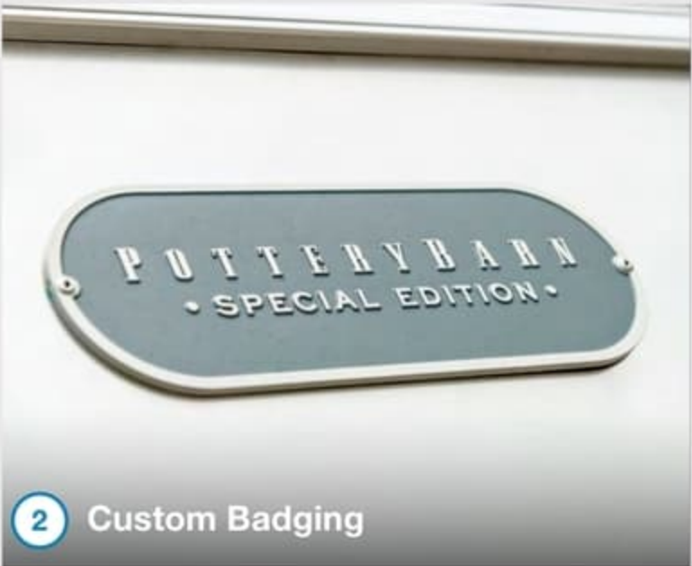
2 Custom Badging

The perfect place to enjoy a cocktail with friends