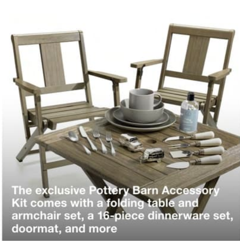
The exclusive Pottery Barn Accessory Kit comes with a folding table and armchair set, a 16-piece dinnerware set, doormat, and more