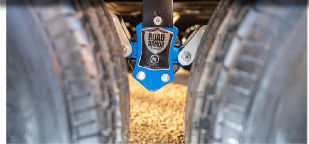
ROAD ARMOR® BY TRAIL AIR®

All Brookstone models include the industry staple Solid Step® entry, which features anti-slip, anti-corrosive tread plates, adjustable legs, & a much larger, more secure top step. These steps will maintain their sleek appearance for years to come, as they are stored securely inside the 5th wheel during transit/inclement weather. Each main entry is lit by convenient LED lighting for a safe passage to your new 5th wheel.