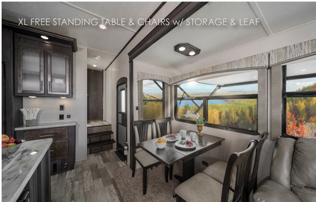
XL FREE STANDING TABLE & CHAIRS w/ STORAGE & LEAF

Every detail was thoughtfully designed into each Brookstone kitchen. Our residential stainless steel appliances include a 14.7 cu. ft. refrigerator (with 1,000-watt pure sine wave inverter), a 30" OTR microwave, & a 21" matching oven with glass cover. There's ample counter space (all solid surface with matching sink covers), a large 50/50 stainless sink with high rise wand sprayer, & enough drawers & pantry storage for any extended voyage you have on the horizon.