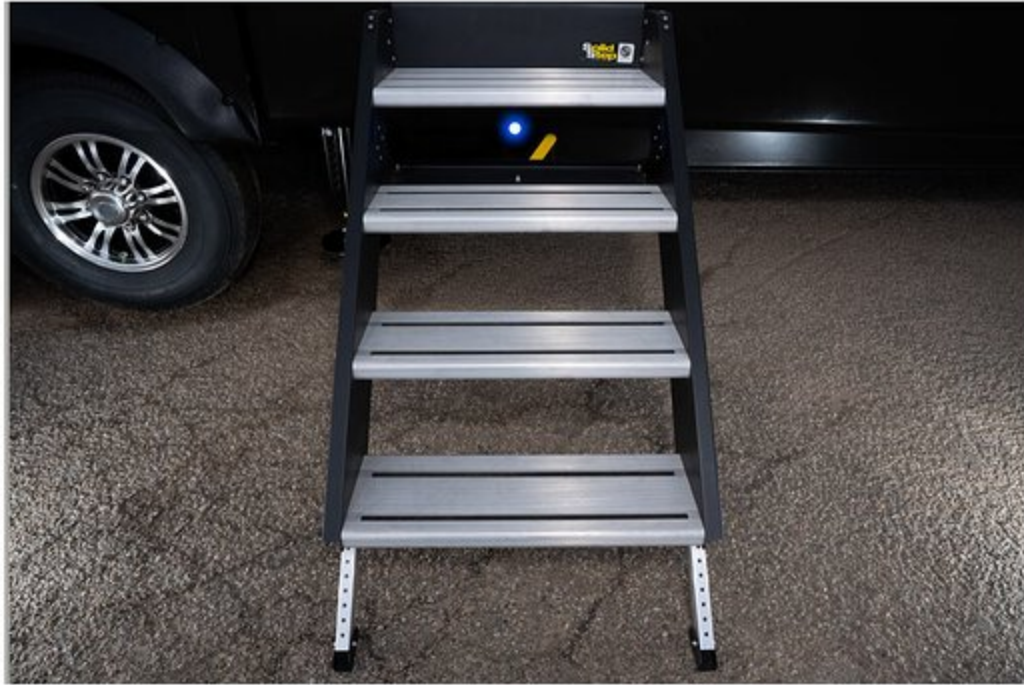
QUAD SOLID STEP® ENTRY