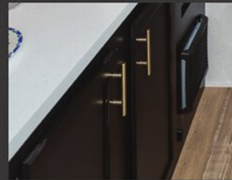
Solid Wood Cabinet Doors