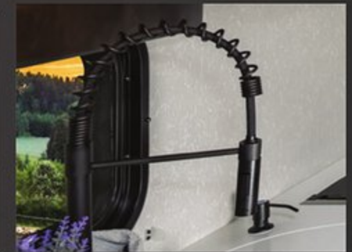
Residential Pullout Faucet