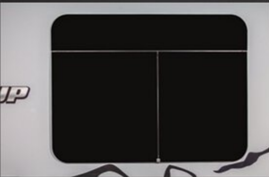
Automotive Frameless Windows Package

The Wolf Pup is proud to offer the Black Label Edition as an optional upgrade to the brand. The Black Label Edition includes all the regular standard Wolf Pup features along these additional highlights shown below.