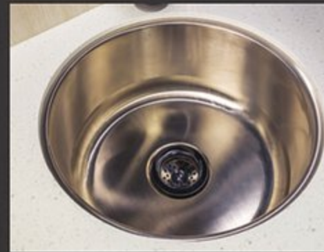
Deep Stainless Steel Sink