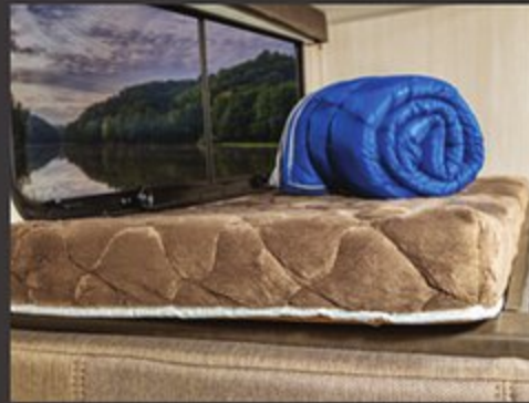
Oversized Bunk Pads