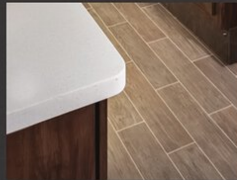
LG Solid Surface Countertop