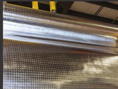
Thermo-Foil Arctic Insulation