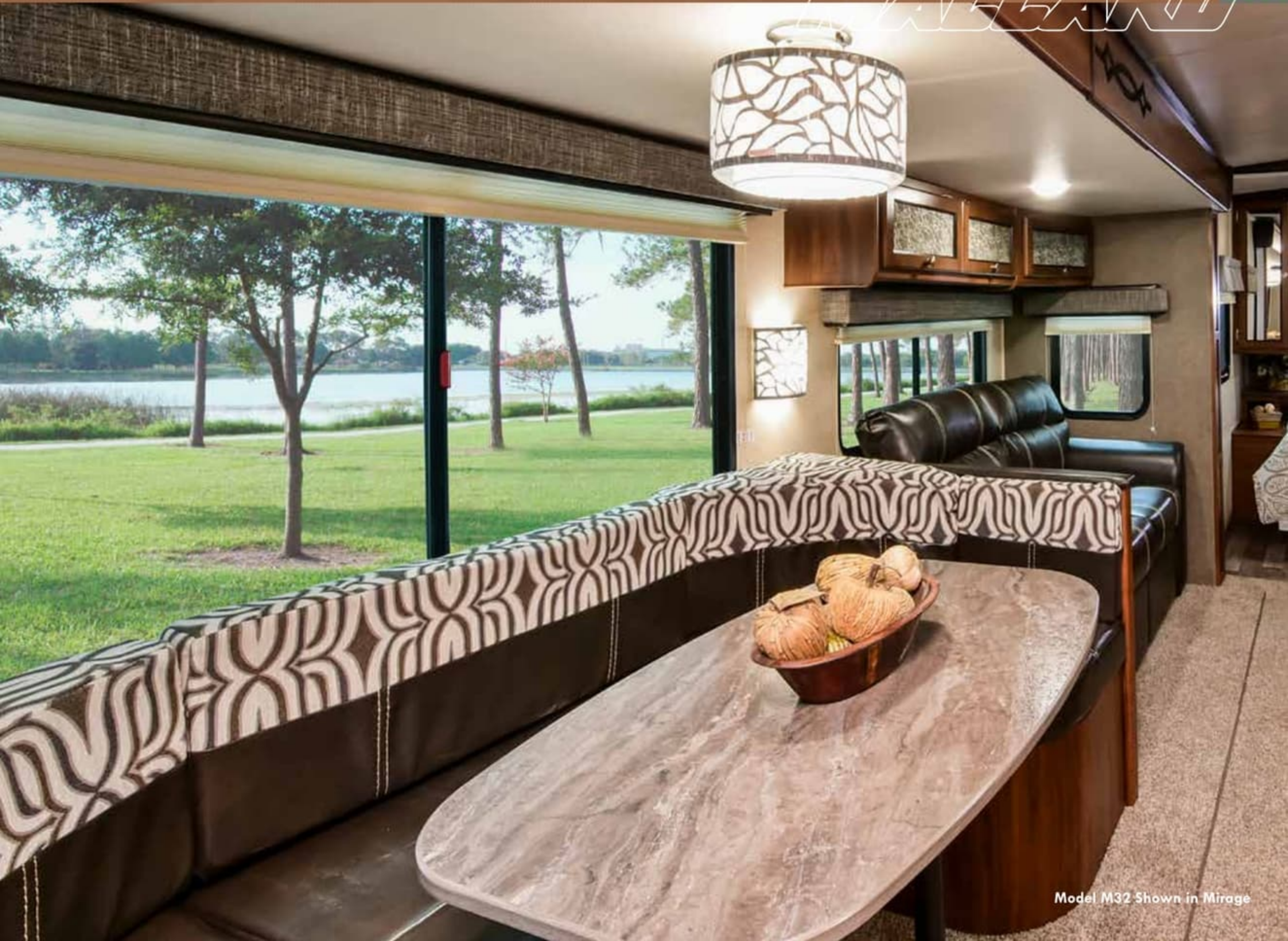
Model M32 Shown in Mirage