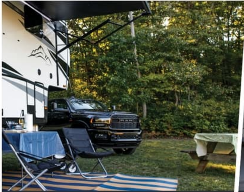
...ss than wood. This process adds strength and durability that others are