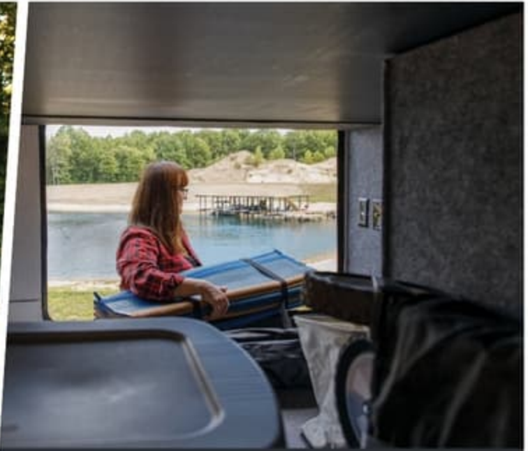
Patent pending Super Store-More 3-sided access to basement with 30% more capacity.