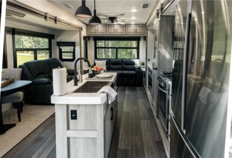
Our beautifully redesigned kitchen and living room features top of the line appliances, full size pantry and plenty of counter space with upgraded woven flooring and Amish hardwood throughout.