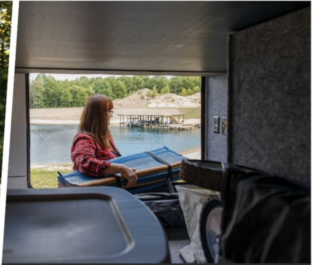
Patent pending Super Store-More 3-sided access to basement with 30% more capacity.