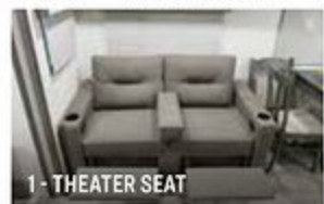
1 - THEATER SEAT