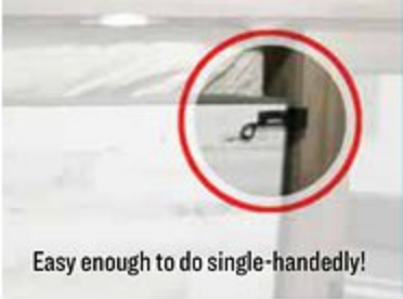
Easy enough to do single-handedly!