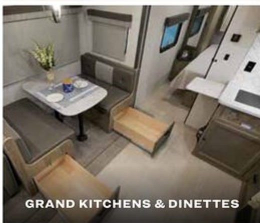
GRAND KITCHENS & DINETTES