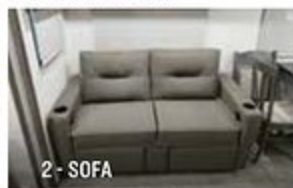
2 - SOFA