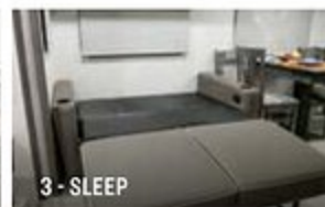
3 - SLEEP

... to make old New Again!, the renaming goes back to our Roots almost 20 years. What can be more than "Grand", we think this is Glamping at its best, welcome to your 5-Star Resort On Wheels!