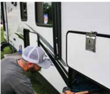
No Mattress-Open Storage!