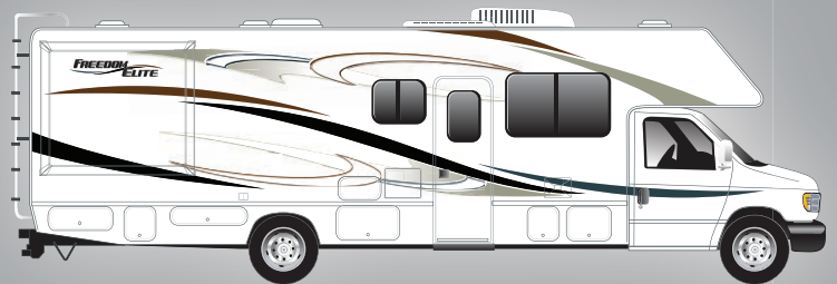
FUSION EXTERIOR GRAPHICS PACKAGE