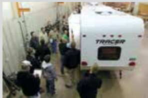
Executive Quality Audits