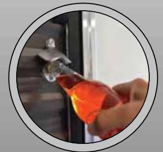
EXTERIOR BOTTLE OPENER