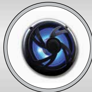
BLUE LED LIT OUTDOOR SPEAKERS