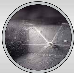
BLACK TANK FLUSH (N/A ATI)