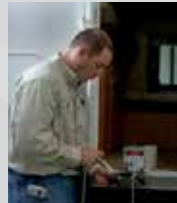
65 Point Secondary PDI