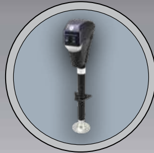
ELECTRIC TONGUE JACK (N/A ATI)