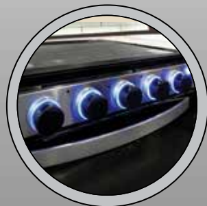
GLASS TOP STOVE WITH LED LIGHTING