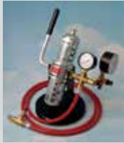
Seek-A-Leak Pressure Test

Prime Time Manufacturing is proud to be recognized as an industry leader in value, reliability, and overall quality by the Recreational Vehicle Dealers Association. We are committed to "A Higher Standard" in design, construction, testing, and customer service. Check us out — we know you'll be impressed!