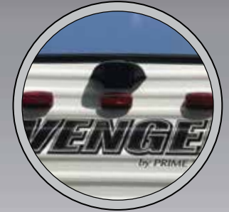
BACK UP CAMERA PREP