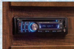
Connex AM/FM/CD/DVD player with Bluetooth has two TV out RCA jacks, a USB and an SD card reader.