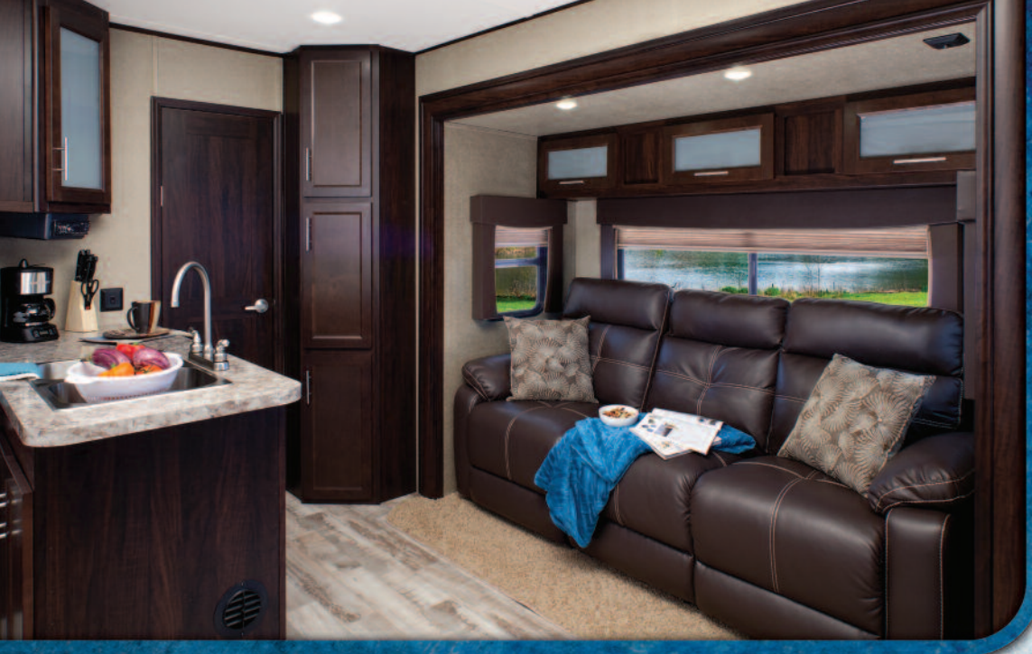
The half ton towable 30HDS is impressive, with opposing slides that create an expansive main living area. It has more cabinet and pantry storage than many big fifth wheels! Hyper Lite models are appointed with espresso cabinets featuring frosted glass upper cabinet doors and contemporary light birch wood plank style flooring. Shown here with the optional three recliner sofa in Chestnut decor.