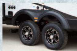
Standard nitrogen filled tires and LCI Equa-Flex® suspension work together for a smooth, comfortable ride that's easy on your toys.