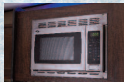
Stainless Steel appliances include a Microwave, Cook Top and Refrigerator.