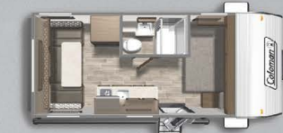
LANTERN LT 17RD Length: 21' 2" Weight: 3,136 lbs. Sleeps: 2-4 Hitch: 467 lbs. Height: 11'4"