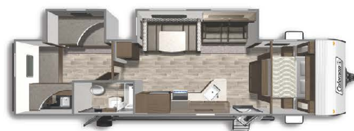
LANTERN 334BH Length: 37' 3" Weight: 8,018 lbs. Sleeps: 4-8 Hitch: 1,062 lbs. Height: 11'4"