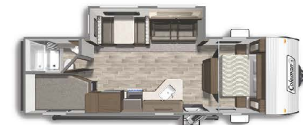
LANTERN LT 262BH Length: 28' 7" Weight: 4,714 lbs. Sleeps: 4-8 Hitch: 752 lbs. Height: 11'4"