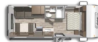
LANTERN LT 202RD Length: 24' 11" Weight: 4,278 lbs. Sleeps: 2-4 Hitch: 586 lbs. Height: 10'10"