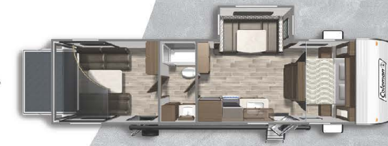
LANTERN TOY HAULER 300TQ Length: 34' 10" Weight: 6,712 lbs. Sleeps: 4-8 Hitch: 998 lbs. Height: 12'4"