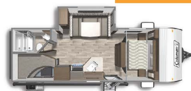
LANTERN 244BH Length: 27' 7" Weight: 5,541 lbs. Sleeps: 4-6 Hitch: 648 lbs. Height: 11'1"