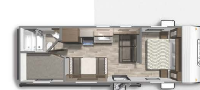
LANTERN LT 274BH Length: 30' 7" Weight: 5,833 lbs. Sleeps: 4-8 Hitch: 582 lbs. Height: 10'4"