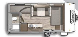
LANTERN LT 17B Length: TBD Weight: TBD Sleeps: TBD Hitch: TBD Height: TBD