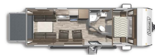
LANTERN TOY HAULER 250TQ Length: 29' 7" Weight: 5,569 lbs. Sleeps: 4-8 Hitch: 909 lbs. Height: 11'5"