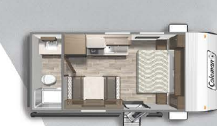
LANTERN LT 18RB Length: 22' 5" Weight: 3,111 lbs. Sleeps: 2-4 Hitch: 434 lbs. Height: 9'9"