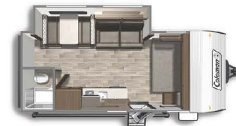
LANTERN LT 18FQ Length: 22' 9" Weight: 3,980 lbs. Sleeps: 2-4 Hitch: 458 lbs. Height: 10'1"