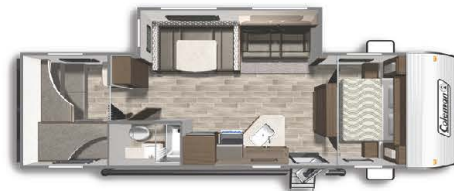
LANTERN 295QB Length: 32' 8" Weight: 6,281 lbs. Sleeps: 4-8 Hitch: 821 lbs. Height: 11'4"