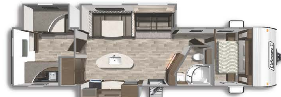
LANTERN 337BH Length: 37' 11" Weight: 8,493 lbs. Sleeps: 4-8 Hitch: 1,083 lbs. Height: 11'4"