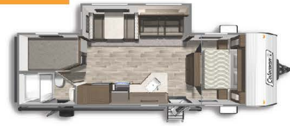
LANTERN 263BH Length: 30' 7" Weight: 6,129 lbs. Sleeps: 4-6 Hitch: 800 lbs. Height: 11'1"