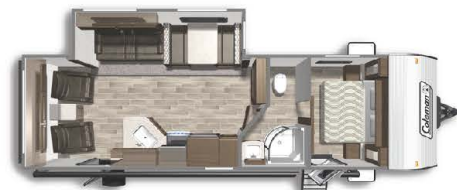
LANTERN 264RL Length: 30' 11" Weight: 6,152 lbs. Sleeps: 2-4 Hitch: 753 lbs. Height: 11'3"