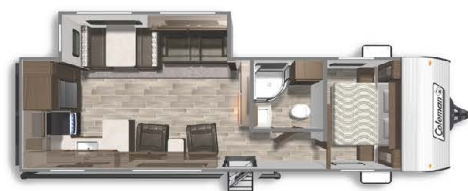
LANTERN 286RK Length: 32' 11" Weight: 6,396 lbs. Sleeps: 2-4 Hitch: 708 lbs. Height: 11'3"