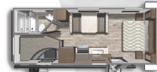
LANTERN LT 215BH Length: 25' 11" Weight: 4,510 lbs. Sleeps: 4-8 Hitch: 552 lbs. Height: 10'7"