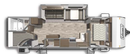
LANTERN 285BH Length: 32' 9" Weight: 6,620 lbs. Sleeps: 4-8 Hitch: 869 lbs. Height: 11'2"