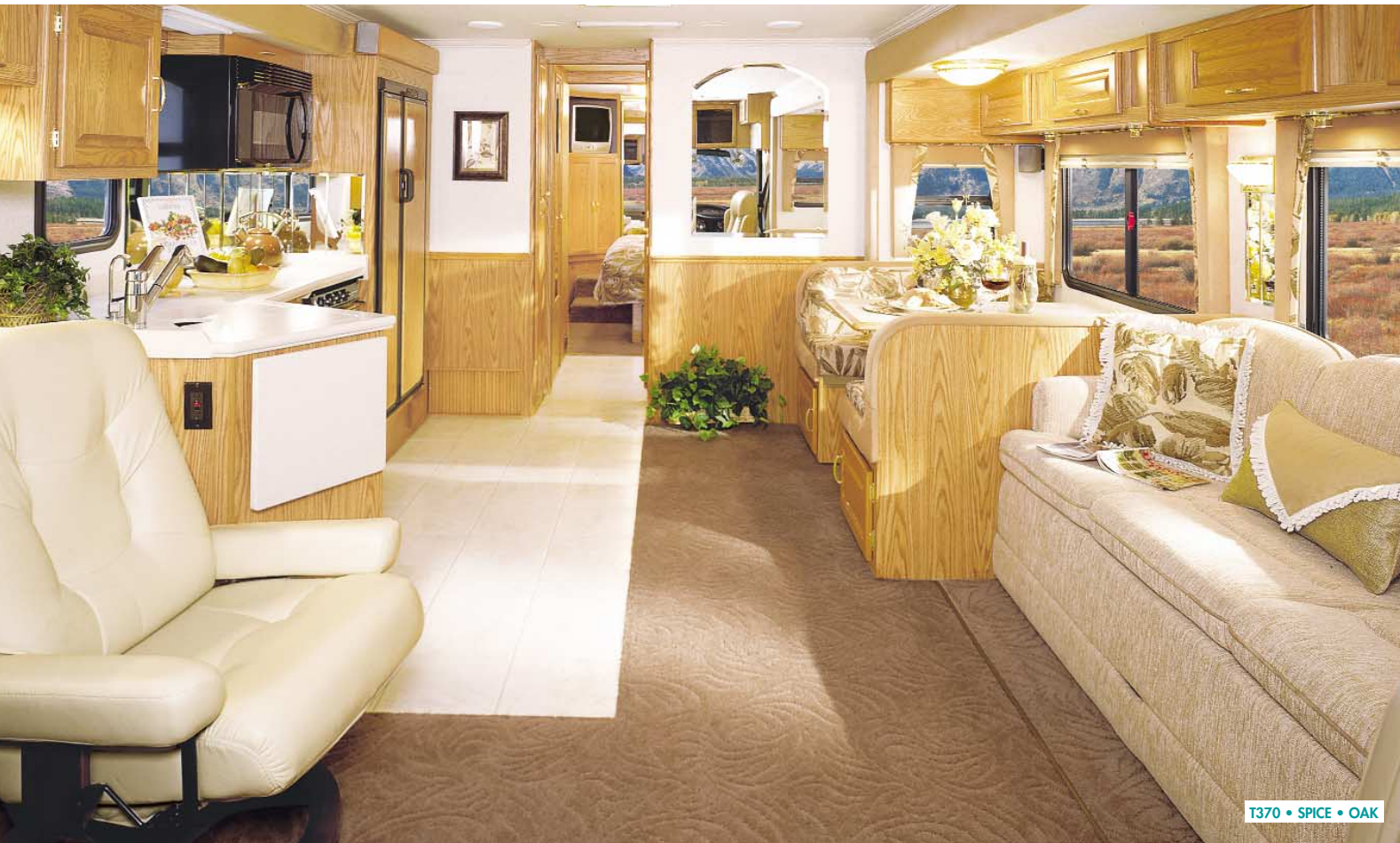
T370 • SPICE • OAK

T ropi-Cal is back with diesel power, thoughtful new interiors and more living space than ever. And with loads of standard features, Tropi-Cal is the best buy going in diesel motorhomes!