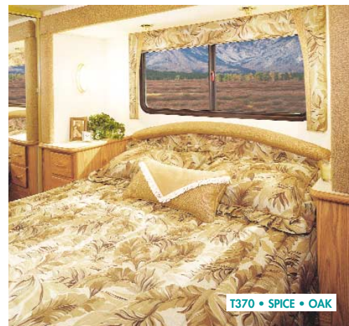
T370 • SPICE • OAK

naces and a cocoon of block foam insulation vacuum-bonded into the steel-framed coach body.