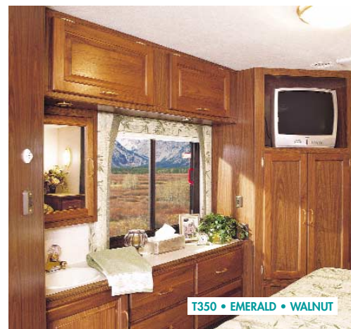
T350 • EMERALD • WALNUT

Tropi-Cal boasts many "residential" features to make you feel right at home, including National RV's exclusive "Sandpiper Deluxe" pillow top mattress and floors covered with patterned plush carpeting and hand-laid ceramic tile. Each floorplan also features two wash basins for extra convenience.