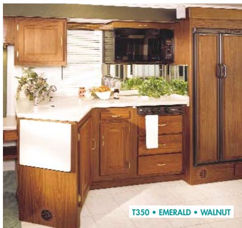
T350 • EMERALD • WALNUT

The Onan® 7.5 kW diesel generator, 50 amp shore power and optional 2,000 watt inverter keep the coach powered up and the good times rolling, whether in a nice campground or far from civilization. Whatever the weather conditions are, Tropi-Cal remains comfortable inside with dual low profile air conditioners, dual fur-