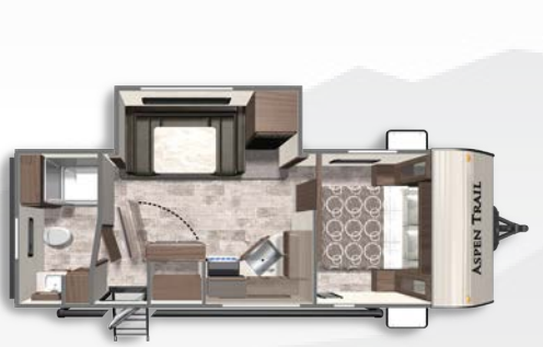
ASPEN TRAIL 2260RBS Length: 26' 11" Weight: 5,664 lbs. Sleeps: 2-4 Hitch: 574 lbs. Height: 11' 3"