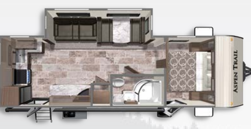
ASPEN TRAIL 2610RKS Length: 30' 3" Weight: 6,373 lbs. Sleeps: 4-6 Hitch: 801 lbs. Height: 11'5"