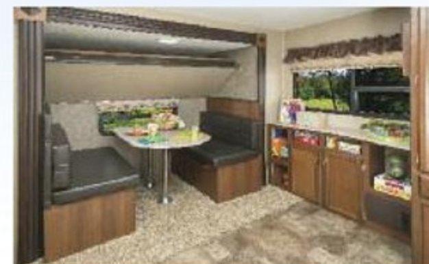
312 BHDS This generous deep slide bunkhouse model accommodates 11 people, and features a fireplace/entertainment center and oversized U-dinette. Shown in Autumn decor.