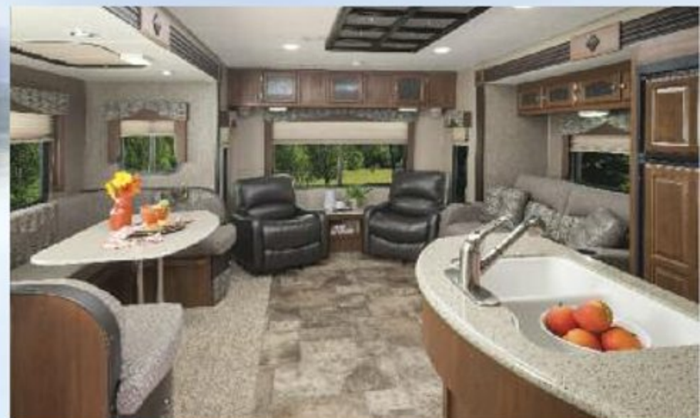
293 RLDS Shown in Slate decor.

The Liberty Edition luxury upgrade is available on Deep slide models (Maple Leaf Edition in Canada). It includes high end amenities usually reserved for travel trailers and fifth wheels costing thousands of dollars more.