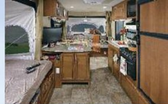
21 TQX This triple-tent model is shown in Truffle decor.