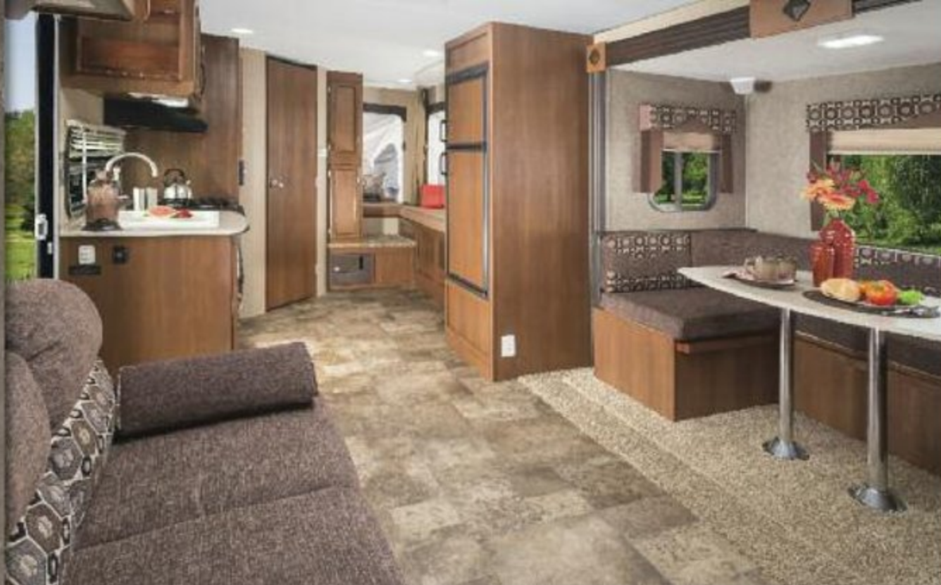
23 TQX Freedom Express Expandables feature exceptional floor space, storage and counter space – remarkable for an expandable! This triple-tent 23 TQX is shown in Cobblestone decor.