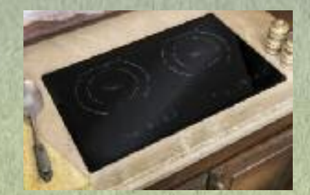
2 Burner Induction Stove Top