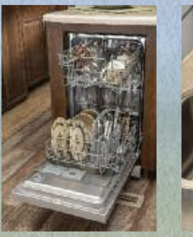
Furrion Double Drawer Dishwasher

This premium package includes these standard features for increased convenience and comfort while enjoying your home away from home.