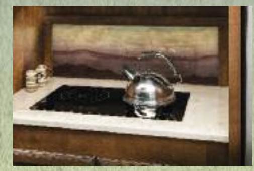
Lighted Kitchen Backsplash with Dimmer