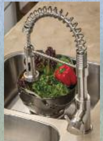
High End Spring High Rise Kitchen Faucet