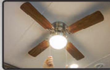
CEILING FAN WITH LIGHT KIT