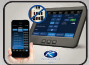
iN-COMMAND CONTROL SYSTEMS