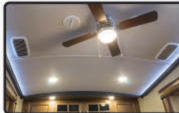
DUAL 15K QUIET COOL AIR CONDITIONING SYSTEM