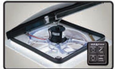
KITCHEN POWER RAIN SENSOR VENT FAN W/MULTI-SPEED WALL CONTROL