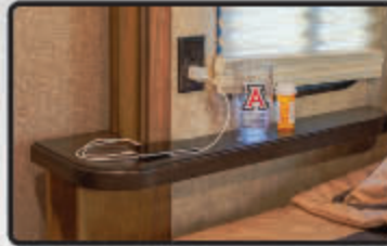
WRAP AROUND HARDWOOD NIGHT STANDS W/OUTLETS AND CUBBY STORAGE