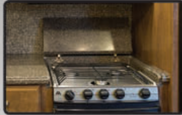
SOLID SURFACE HINGED RANGE COVER