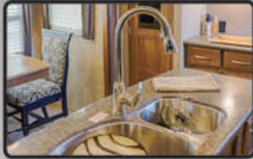
70/30 SINK W/PULL OUT FAUCET W/SOLID SURFACE SINK COVERS