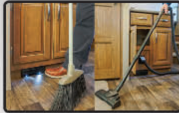
CENTRAL VACUUM W/KITCHEN TOE KICK W/ BOTH INTERIOR & EXTERIOR HOSE PORTS