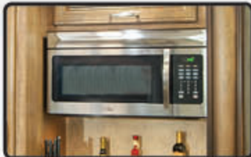
30" RESIDENTIAL CONVECTION MICROWAVE