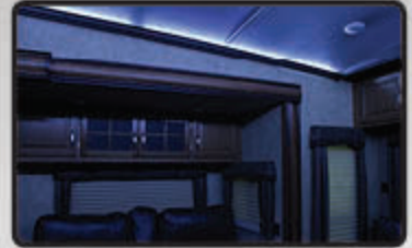
BACK-LIT CROWN MOLDING AMBIENT CEILING LIGHT