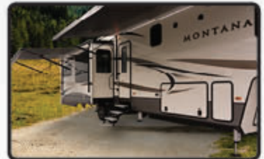
2ND PATIO AWNING W/LED LIGHT STRIP (SELECT MODELS)