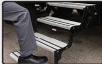
FOUR STEP ALUMINUM STEP TREADS FOR CONVENIENCE/COMFORT