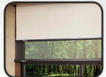
UPGRADE DAY/NIGHT ROLLER SHADES