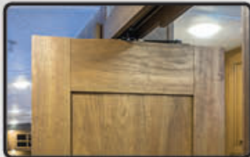
CLEVER SPACE SAVING PIVOT HINGE BATH DOOR