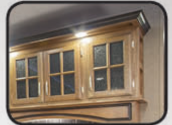
HARDWOOD CHERRY CABINET FRAMING (STILES)