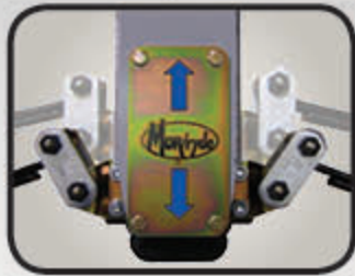
EXCLUSIVE MOR/RVDE 4100 SUSPENSION SYSTEM W/ WET BOLTS