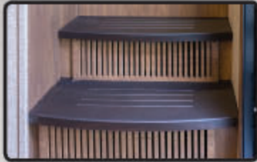
HARD SURFACE INTERIOR STEPS