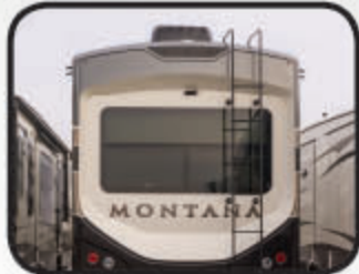
DECORATIVE FIBERGLASS REAR CAP (N/A 3790, 3791)