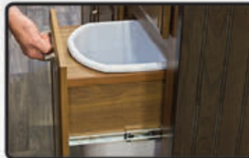
PULL OUT KITCHEN TRASH CAN STORAGE (SELECT MODELS)