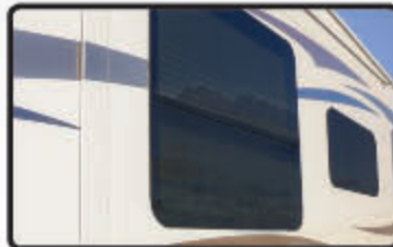
UPGRADE FRAMELESS WINDOWS