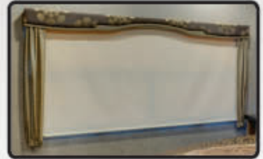
UPGRADE BLACKOUT ROLLER SHADES THROUGHOUT