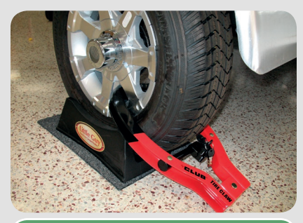
Teardrop Lock let people know you care about your trailer and it is YOURS!