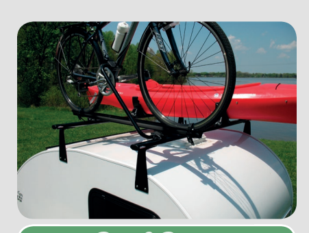
Roof Rack Need some more cargo room? Store a bike, boat, skis or more gear on top!