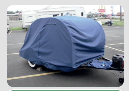
Covers protect from UV, Acid Rain, Sap and more...