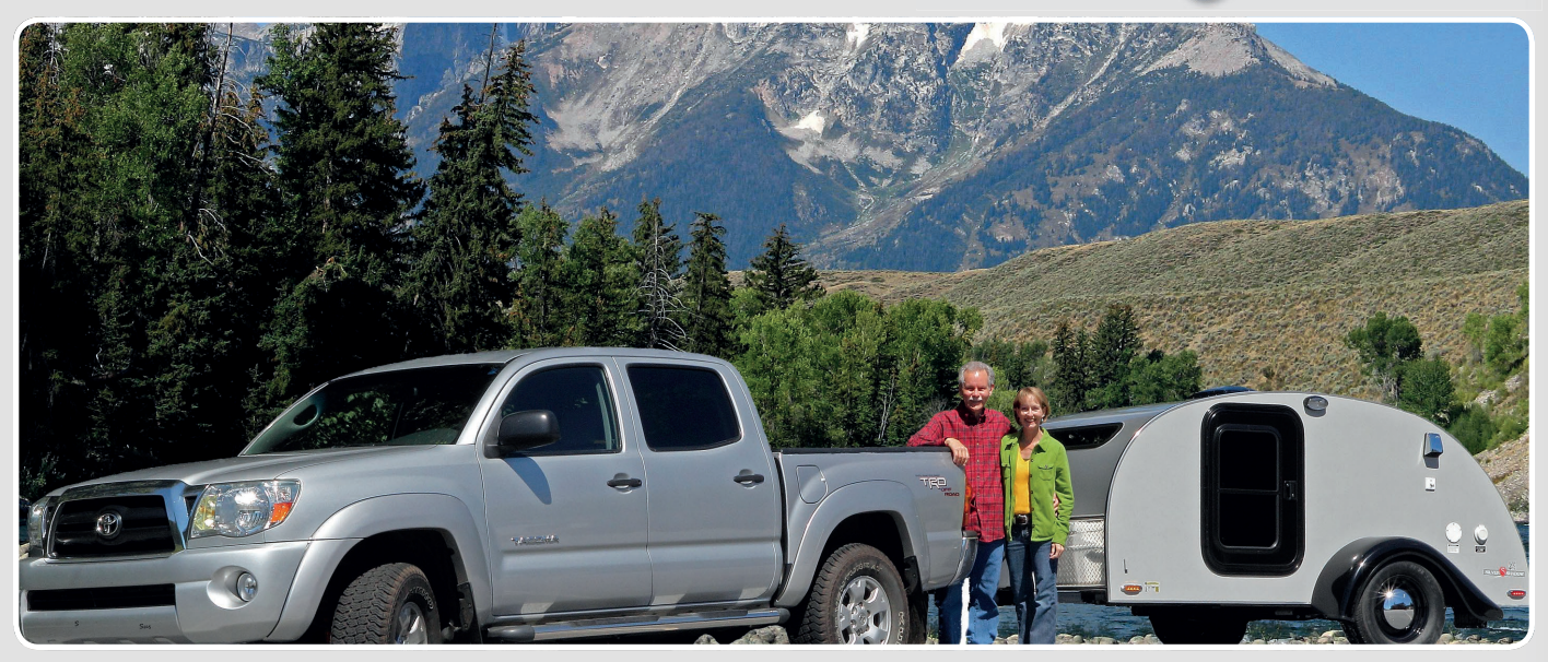
5x8 vs. 5x10 – at the end of the day, the only difference is 2 feet of length... but those 2 feet give you the following: a deeper galley (able to handle sink, stove, fridge, AC & more storage), a longer bed and headboard with sliding front doors and internal storage.

The 5x10 and 6x10 Silver Shadows are our 2<sup>nd</sup> and 3<sup>rd</sup> leading selling trailers – and for good reason. These beauties offer the most room, classic styling and boatloads of amenities. In addition to sinks and stoves, these teardrops can come with 12/110 fridges, customized galleys, cabinetry, interior staining, embedded AC units and a headboard.