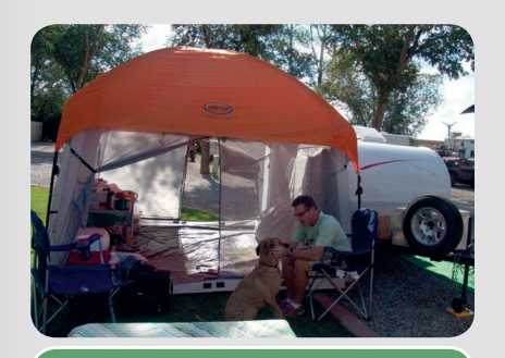
Tent gain 100 sq ft of "living space" with this multi-function screen room & tent.