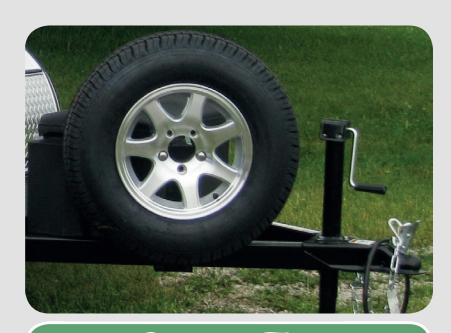
Spare Tire Be prepared for a flat: stores on the tongue or under the trailer.