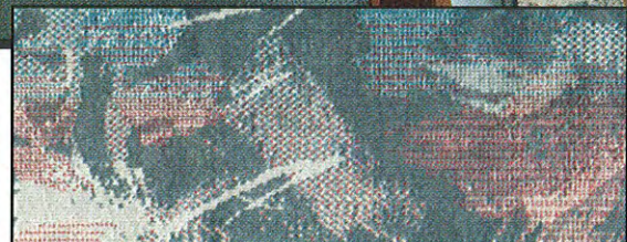
State Fair Wintergreen