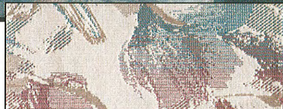
State Fair Taupe

High quality, durable designer fabrics in stylish colors assure you of lasting beauty for years to come.