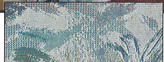
State Fair Blue