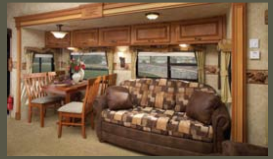
Take in the view through the enlarged picture window in the living and dining areas. Relax on the oversized sofa or entertain at the sleek, expandable table and chairs.

No matter which way the wind blows, you'll find that towing your 2009 Designer is easier and more reliable than other comparable fifth wheels. With the MOR/ryde® suspension and the light weight, welded aluminum-framed sidewalls, towing the Designer can be as luxurious as staying in one. Once you arrive, the Wide-Trac™ landing gear increases stability wherever you decide to park.