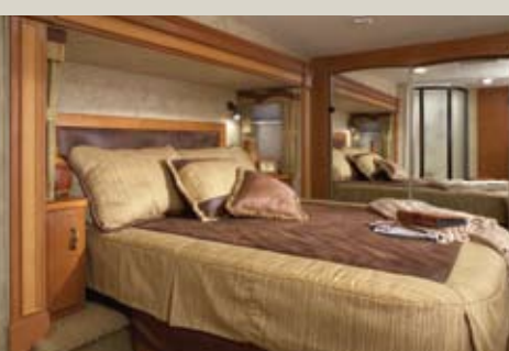
There's plenty of room to relax in the richly appointed bedroom featuring Jayco's Cloud Ten™ mattress, decorative headboard, reading lights and ample storage.