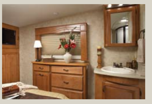
Convenience and comfort are key with the queen size bed in this bedroom that features plenty of wardrobe space and adjoining bathroom amenities.