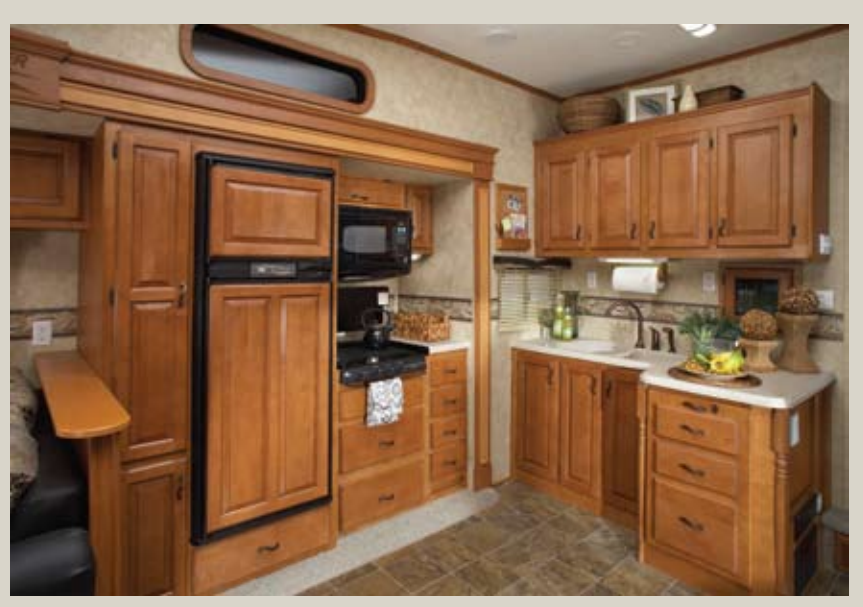
All the conveniences of a modern kitchen are within reach and easy to find along with plenty of pantry space and storage.