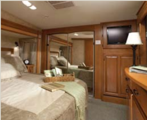
Dream sweet dreams on the queen-size bed or watch the late night shows after a fun-filled day of adventures. The bedroom area is designed for relaxing and unwinding.