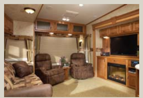
You'll be well-equipped for movie night with this optional deluxe entertainment center featuring a 42" LCD TV and Multi-Media Premium Sound System™ AM/FM/CD/DVD stereo with an MP3 and iPod® input jack.