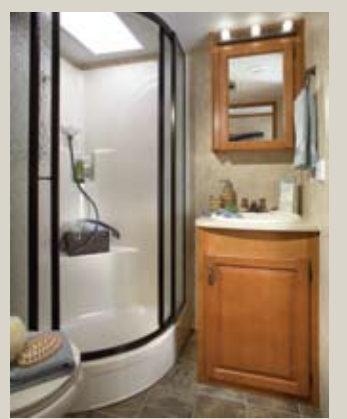
The bathroom includes a 34" fiberglass radius shower with a skylight, glass shower door and residential style medicine cabinet with mirror.