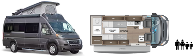
B19 ft Van