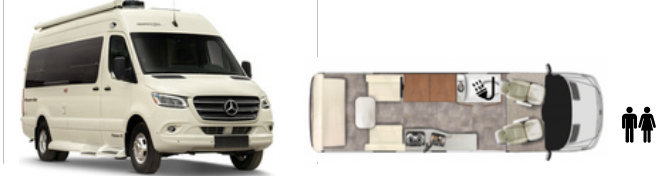
B22 ft Sprinter