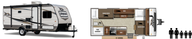
Jay Flight SLX Trailer