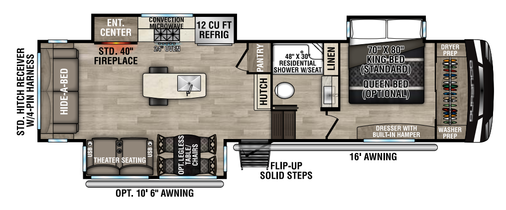
D301RLT UVW - 10,200 | Exterior Length - 34'3" | Sleeps - 4