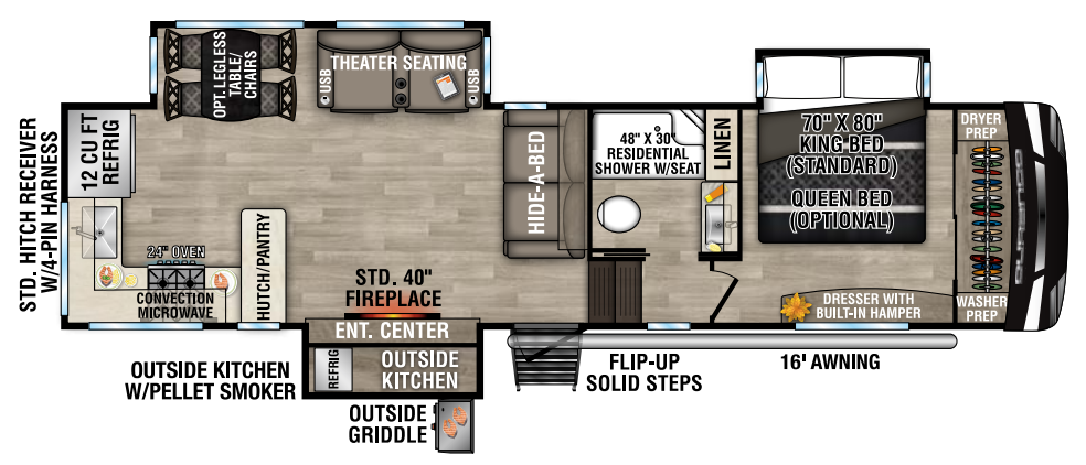
D321RKT UVW - 10,310 | Exterior Length - 34'10" | Sleeps - 4