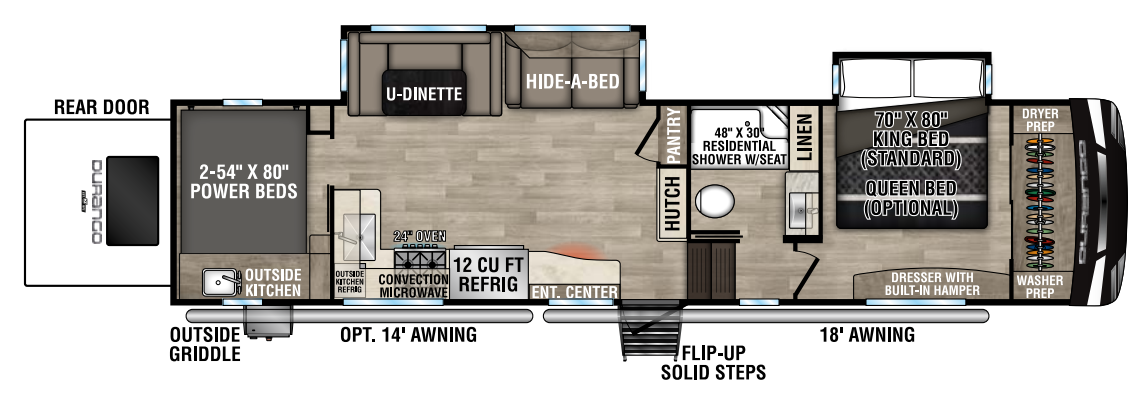
\textbf{D311BHD} \ \, \text{uvw-10,290} \, \mid \, \text{Exterior Length-36'11"} \, \mid \, \text{Sleeps-9}