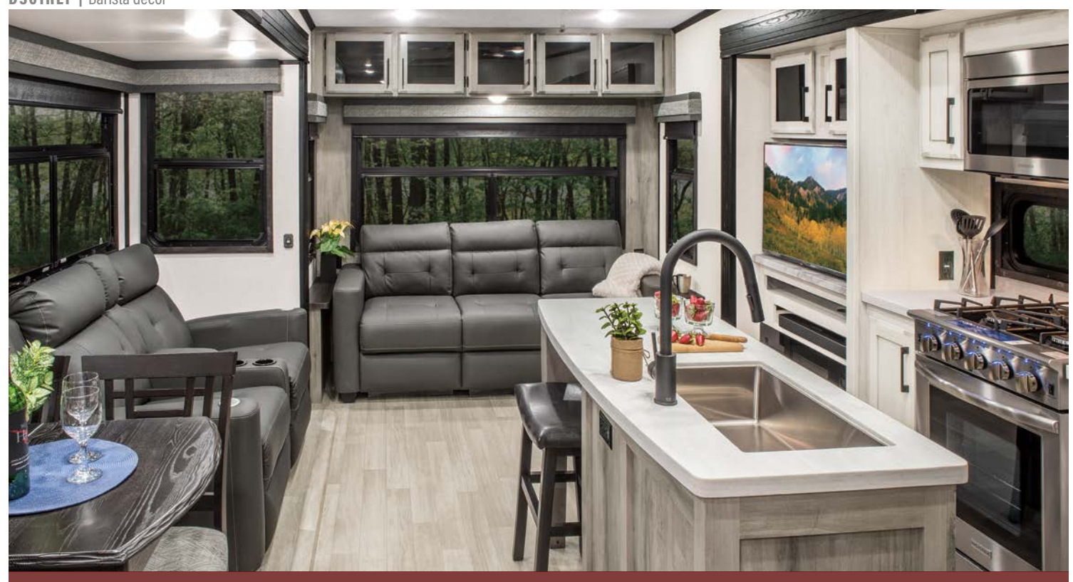
Perks of home sweet home including modern farmhouse cabinetry, solid-surface countertops, stainless steel sink and appliances.