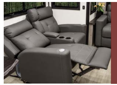
THEATER SEATING with cupholders, USB plug, heat, massage and power recline/ decline.