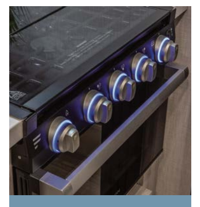
Drop-in COOKTOP with glass cover and OVEN.