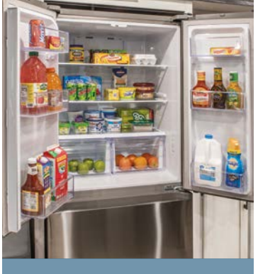
OPTIONAL 18 CU FT RESIDENTIAL REFRIGERATOR with temperature controls and easy slide out freezer drawer below.