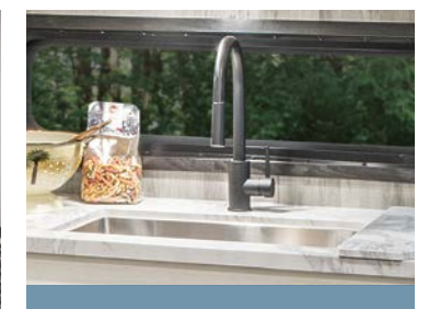
STAINLESS SINK with cover and residential faucet with sprayer.