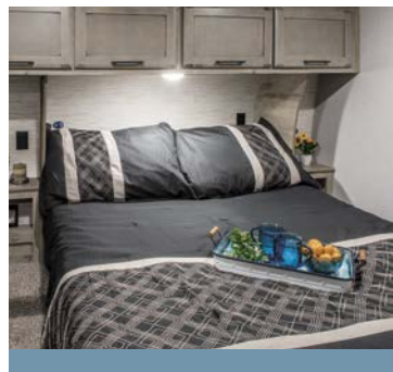
REDESIGNED FRONT BEDROOM with 60 x 80 queen bed.