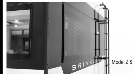
Model Z & G