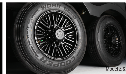
Model Z & G