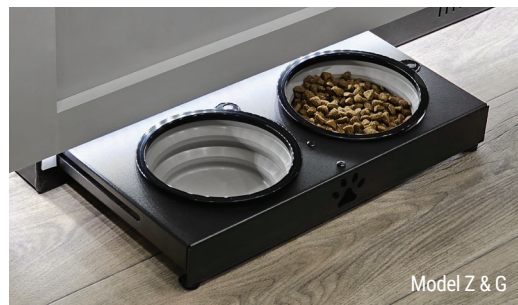
Model Z & G