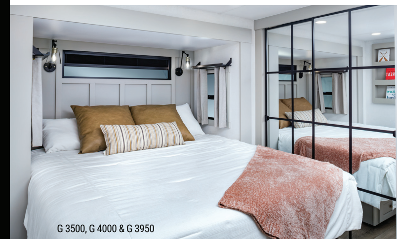
G 3500, G 4000 & G 3950