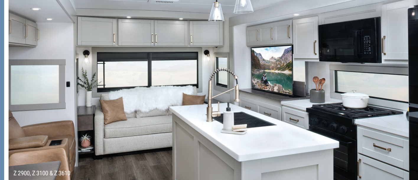
Z 2900, Z 3100 & Z 3610