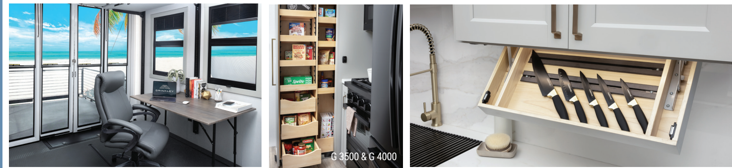
G 3500 & G 4000