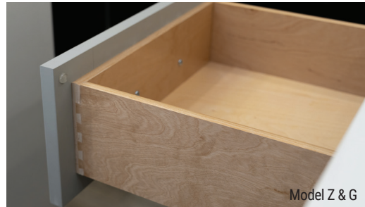
Model Z & G