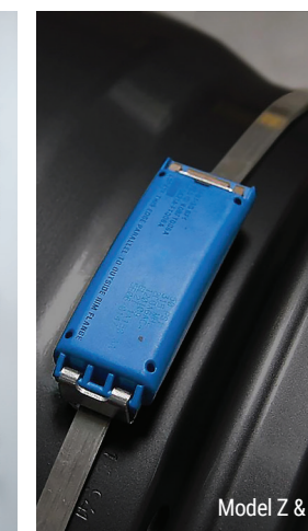
Model Z & G