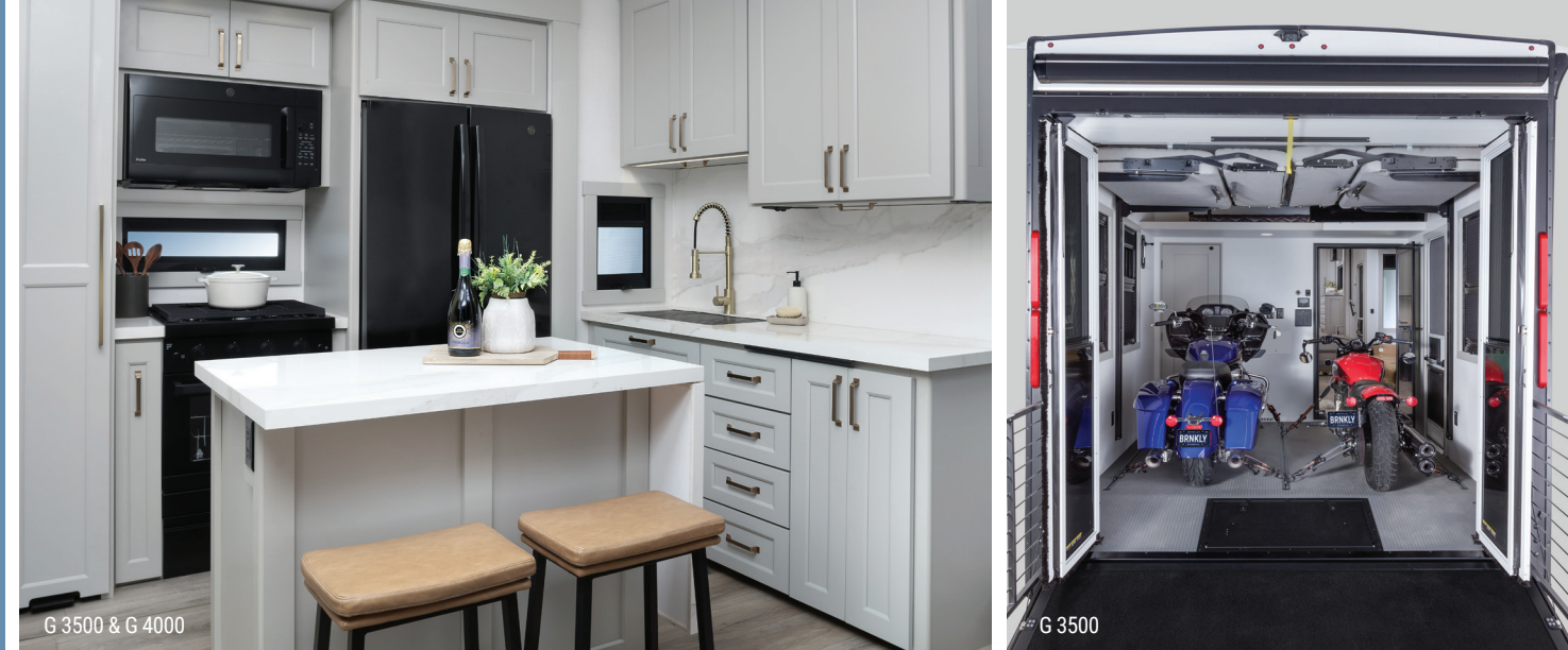
G 3500 & G 4000

• Standard 0 Options P Premium Build Option