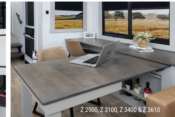
Z 2900, Z 3100, Z 3400 & Z 3610