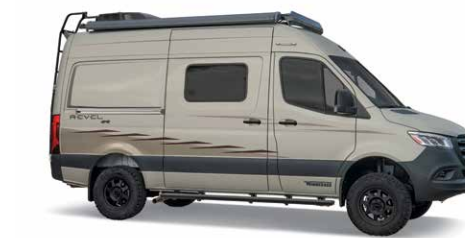
PEBBLE GREY WITH GRAPHICS