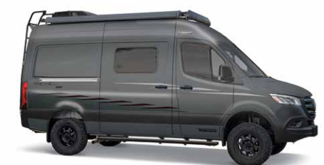
SELENITE WITH GRAPHICS