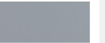
Cabinets - Pewter