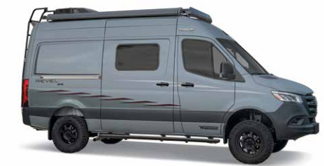
BLUE GREY WITH GRAPHICS