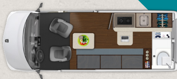
Axion daytime floor plan

GPS, Satellite Radio, Back-up Monitor, Adjustable Steering, Back-up Sensors, Aluminum Rims, Class 5 Receiver Hitch