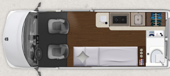
Axion nighttime floor plan with single bed