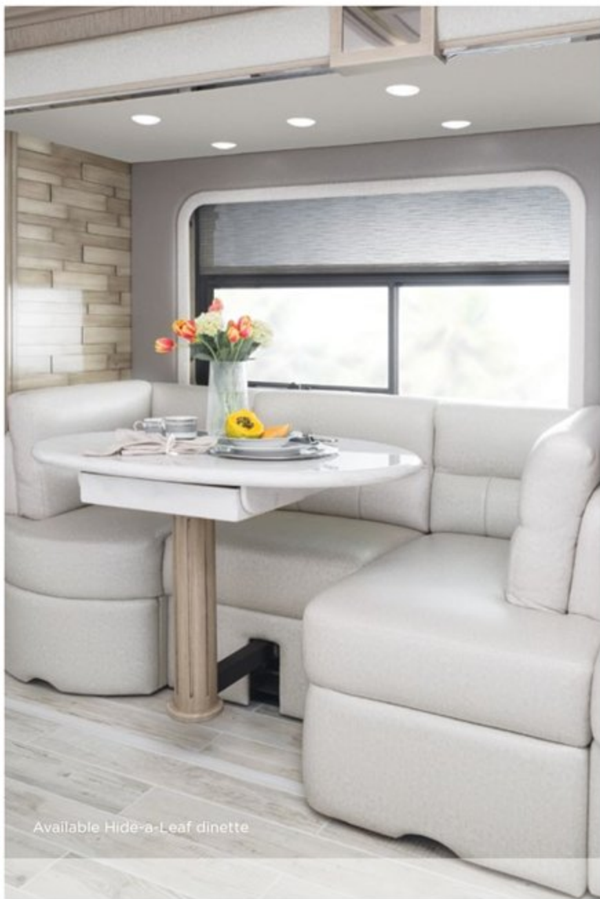
Available Hide-a-Leaf dinette