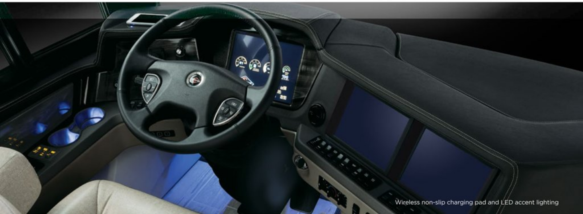
Wireless non-slip charging pad and LED accent lighting