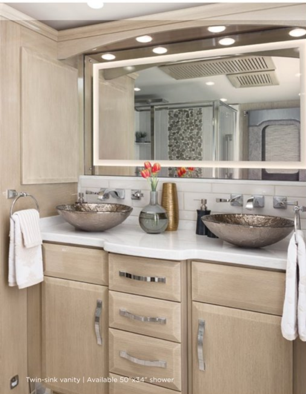
Twin-sink vanity | Available 50"x34" shower