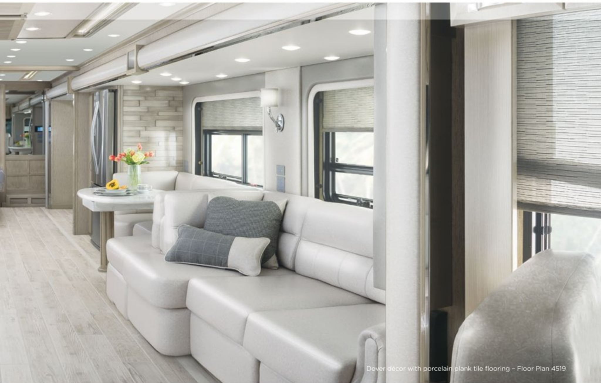
Dover décor with porcelain plank tile flooring - Floor Plan 4519