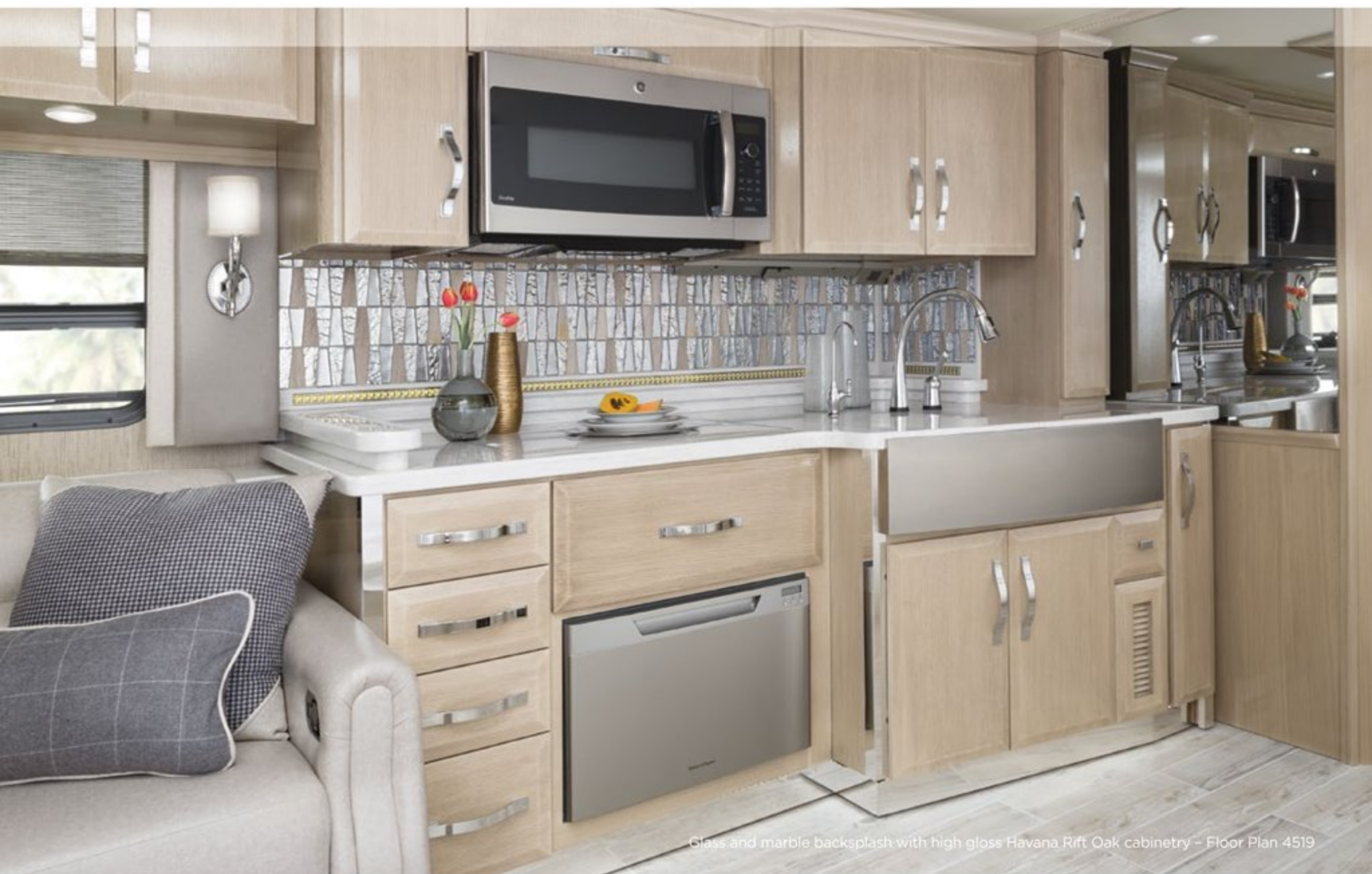
Glass and marble backsplash with high gloss Havana Rift Oak cabinetry – Floor Plan 4519