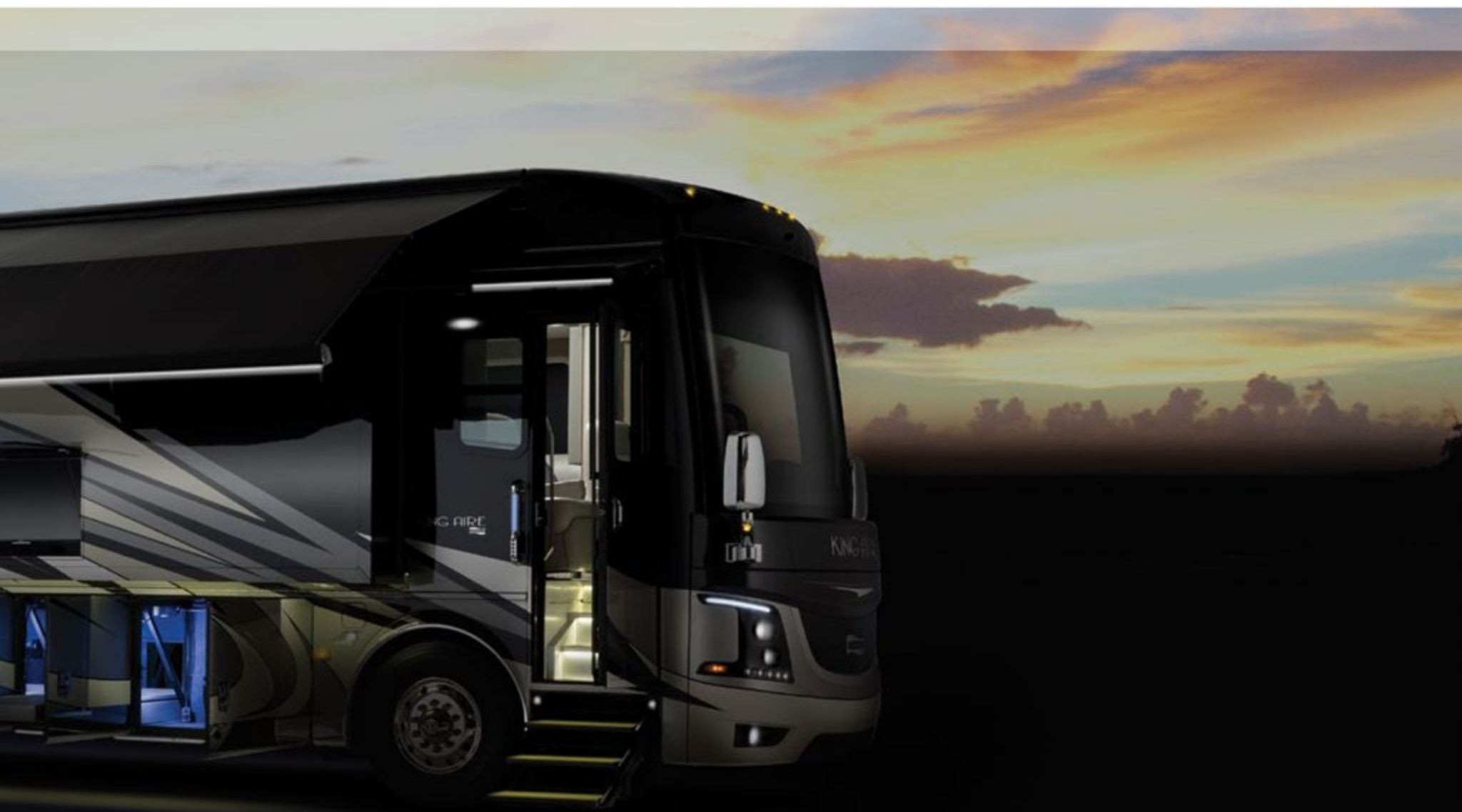
Dual Girard® Nova side awnings and new reinforced automatic entry steps - Dover Exterior