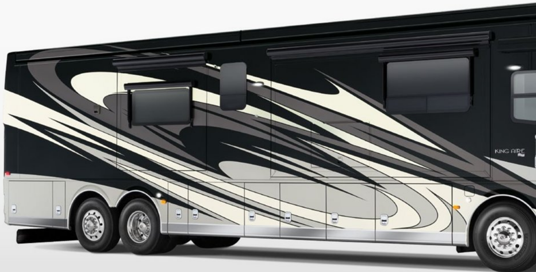
Cut & buffed full-paint Masterpiece™ Finish | Dover Exterior