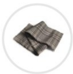
RALPH LAUREN® HOME COLLECTION Representing the world's finest textiles

Many consider the King Aire master bedroom to be the finest found in any Class A coach. Appointed with fabrics from Ralph Lauren®, the King-size bed is where you will find a Sleep Number® adjustable mattress crowned by a window headboard with sliding panels. Come movie night, King Aire supplies everything but the popcorn, including a second 49" Sony® 4K UHD TV, Blu-ray player and a Bose® one-piece surround sound system. What's more, each nightstand doubles as a wireless charging station.