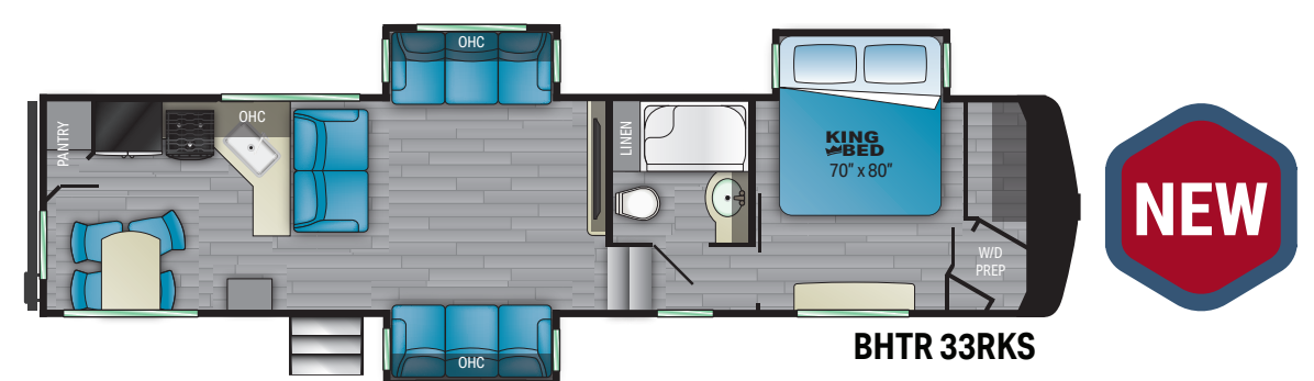
Length - TBD