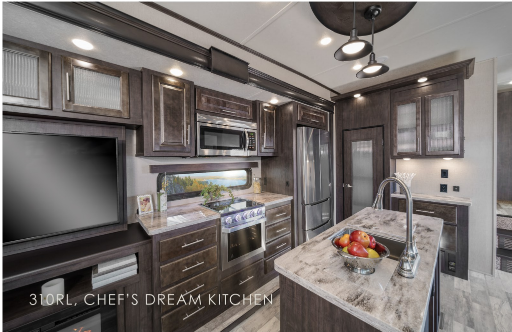
310RL, CHEF'S DREAM KITCHEN