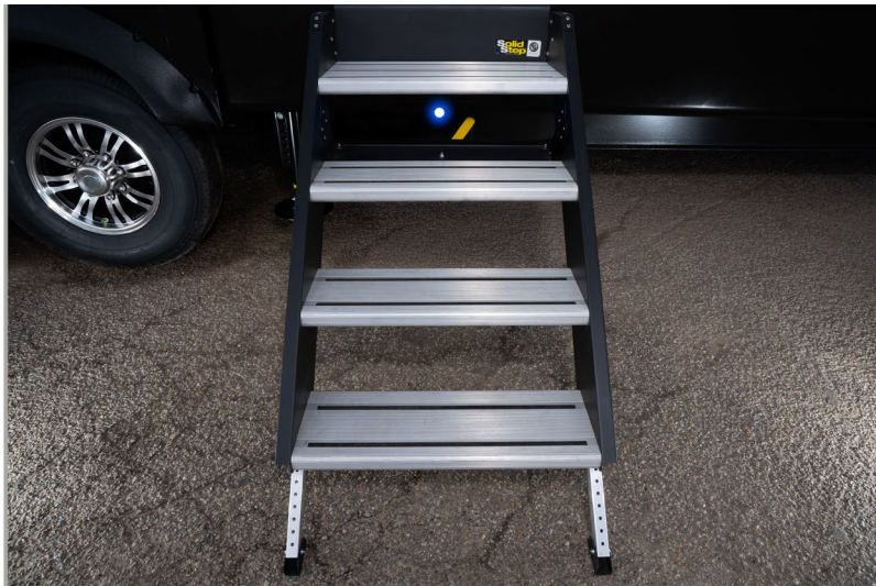
QUAD SOLID STEP® ENTRY