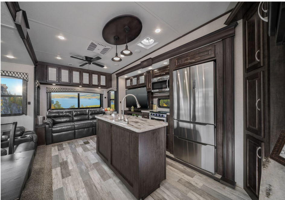
398MBL KITCHEN/LIVING, RICH COCOA DECOR