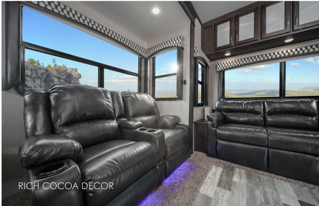
RICH COCOA DÉCOR