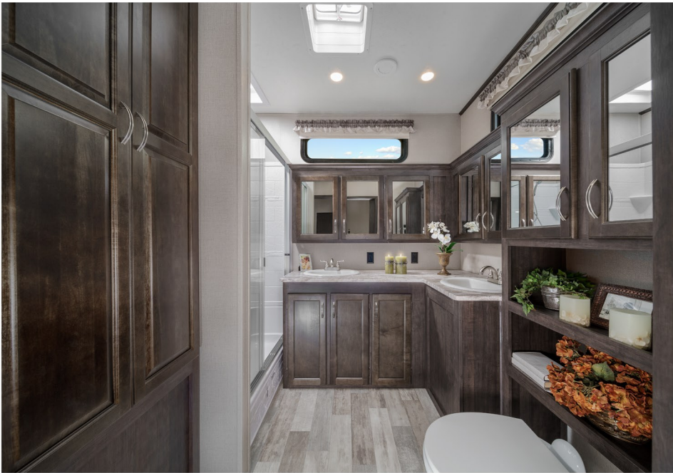
344FL DUAL LAV BATH