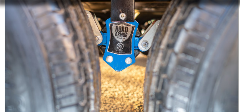
ROAD ARMOR® BY TRAIL AIR®

All Brookstone models include the industry staple Solid Step® entry, which features anti-slip, anti-corrosive tread plates, adjustable legs, & a much larger, more secure top step. These steps will maintain their sleek appearance for years to come, as they are stored securely inside the 5th wheel during transit/inclement weather. Each main entry is lit by convenient LED lighting for a safe passage to your new 5th wheel.