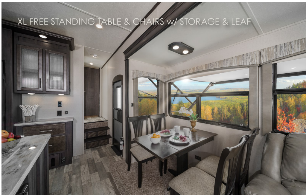
XL FREE STANDING TABLE & CHAIRS w/ STORAGE & LEAF

Every detail was thoughtfully designed into each Brookstone kitchen. Our residential stainless steel appliances include a 14.7 cu. ft. refrigerator (with 1,000-watt pure sine wave inverter), a 30" OTR microwave, & a 21" matching oven with glass cover. There's ample counter space (all solid surface with matching sink covers), a large 50/50 stainless sink with high rise wand sprayer, & enough drawers & pantry storage for any extended voyage you have on the horizon.