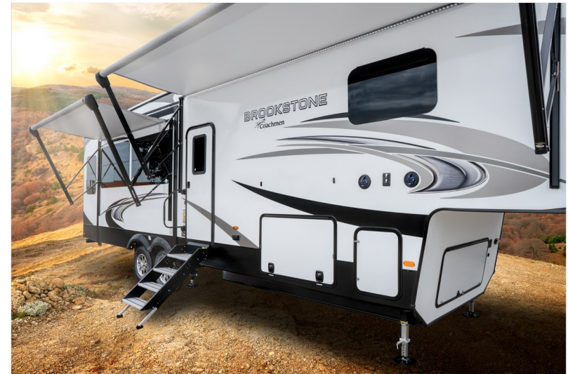
DUAL AWNING OPTION

Brookstone utilizes a massive 10" drop frame for robust construction & best-in-class storage where Radiant Barrier insulation is found throughout. Within, our many features include remote heated gate valves, water filtration prep, outside H/C shower, black tank flush, independent satellite feeds, a water heater bypass valve, battery kill switch, & 6-point auto-level controls.