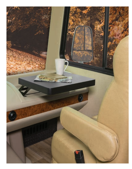
The dash includes a computer workstation with 12V, 110V, and USB outlets—perfect for when you want to work remotely.

IN DESIGNING PURSUIT, WE TOOK CARE OF EVERY DETAIL. THE RESULT? AN EXPERIENCE THAT WILL SURPRISE AND DELIGHT YOU AT EVERY TURN.