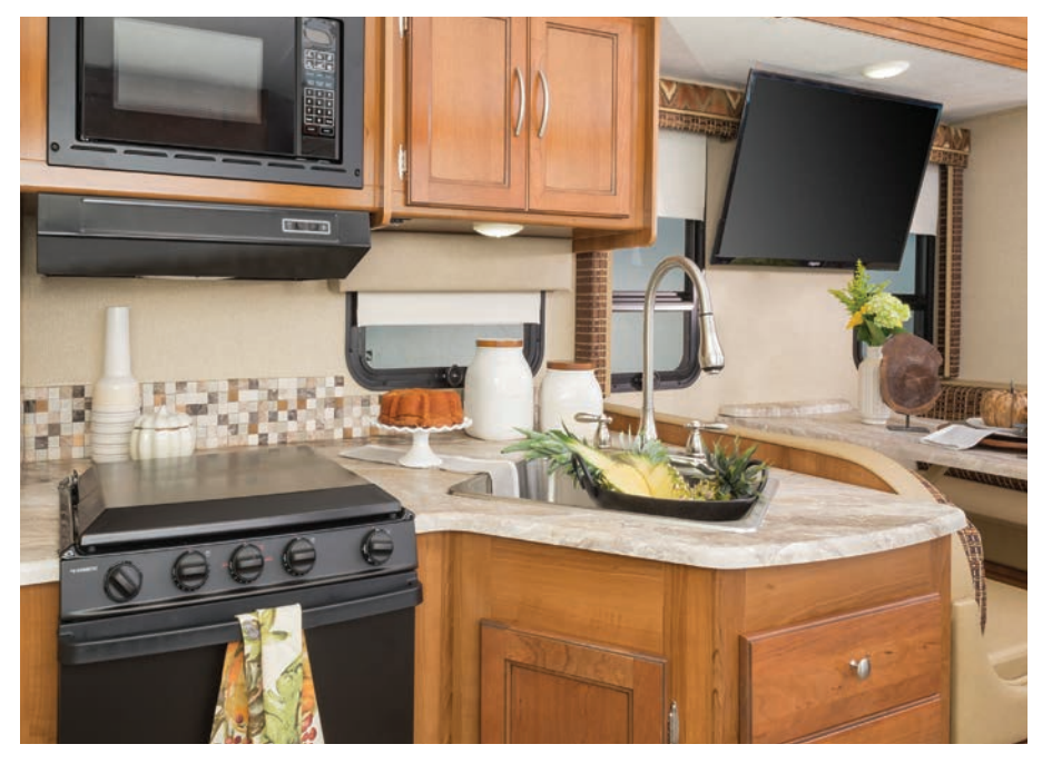
Cooking in Pursuit is a breeze thanks to generous cabinet and countertop space. The attractive tile backsplash adds just the right amount of style.