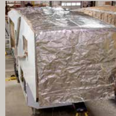
R-38 Radiant shield Thermo-foil wrap through ceilings, underbellies and under front cap.