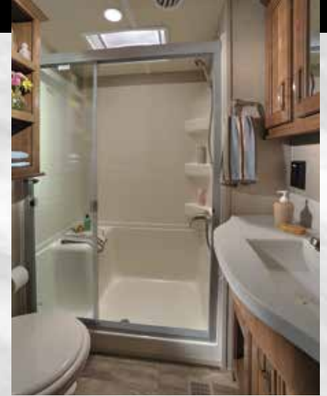
Silverback's luxurious bath includes a large 48" shower with seat and glass doors, porcelain toilet, and a Create-a-Breeze fan.