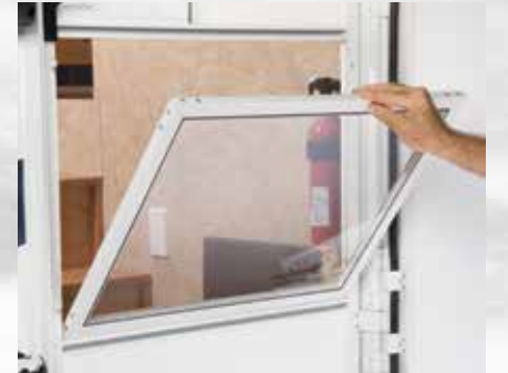
Removable "Soft Top" vinyl storm doors allow light and visibility without losing cooling or heating.