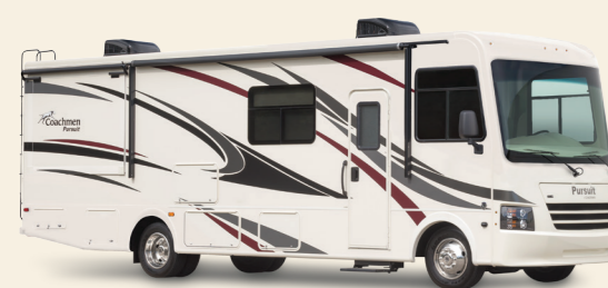
Vinyl Graphics (Standard)