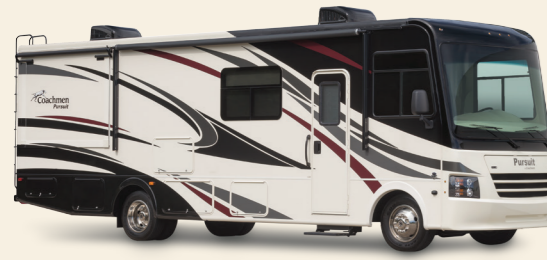
Partial Paint with Vinyl Graphics (Optional)