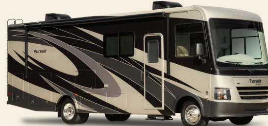
Full-Body Paint – Sand Castle (Optional)

New exterior graphics, including redesigned partial paint and full-body paint options, will make you stand out on the road.