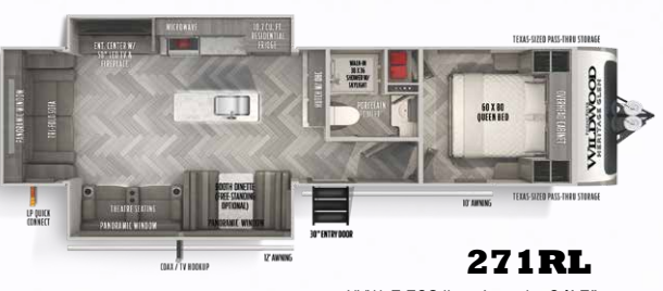
UVW: 7,738 lb. • Length: 34' 7"