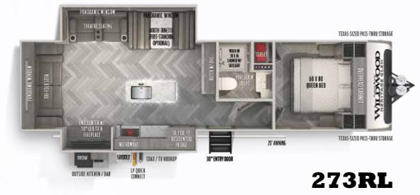
UVW: 7,893 lb. • Length: 34' 7"