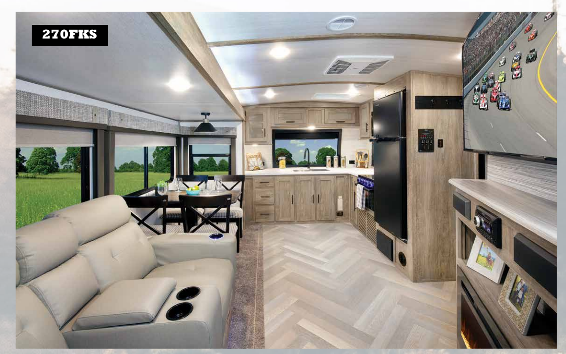
Shown in Newport Decor — Pictured with Optional Free-Standing Dinette