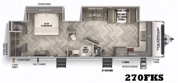
UVW: 7,818 lb. • Length: 33' 9"