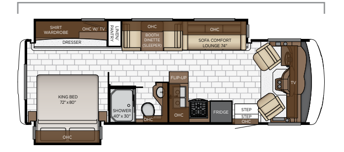
Length: 29' 11"

Length 29'11" Width 101.5" App. Overall Height 12' 04"