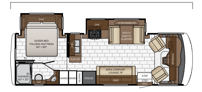
Length: 28′ 11″