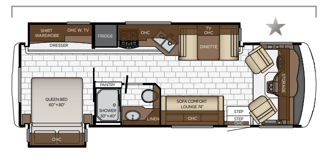
Length: 29' 11"