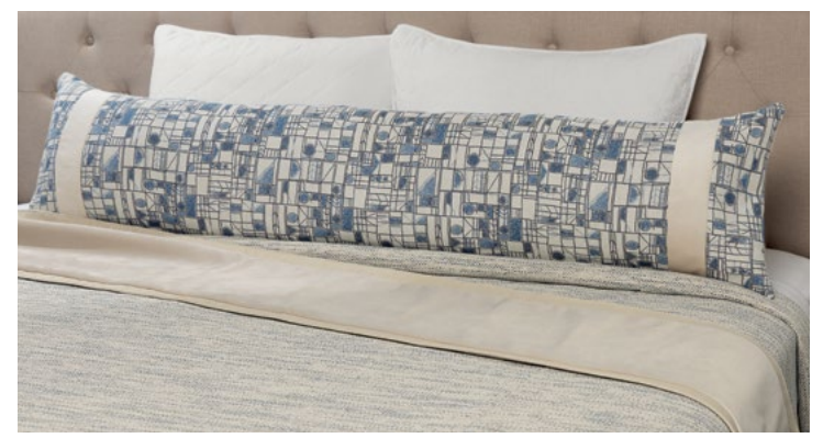
CERVO INTERIOR a. Furniture/Fabric b. Flooring c. Counter Top