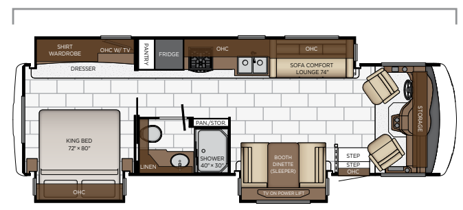
Length: 32′ 11″