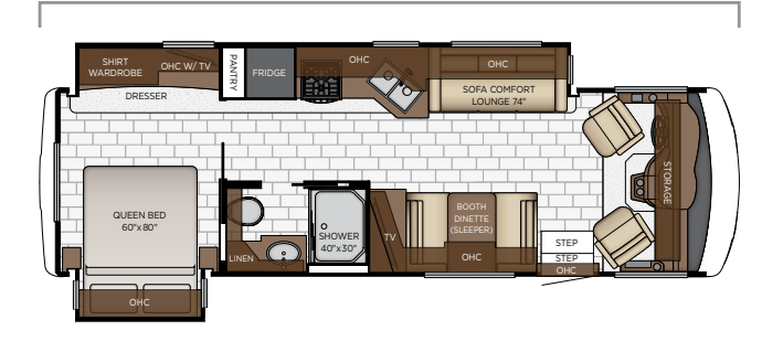
Length: 30′ 11″