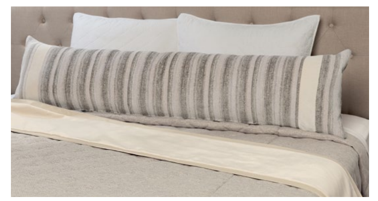
WRIGLEY INTERIOR a. Furniture/Fabric b. Flooring c. Counter Top