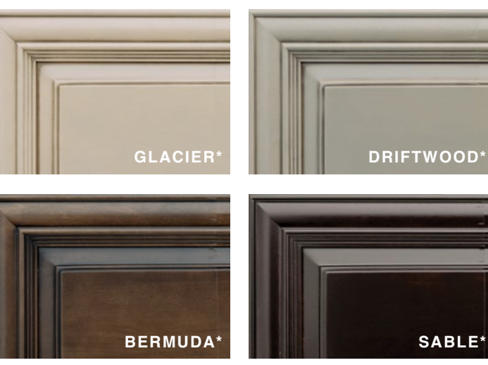
*Available in High Gloss or Matte Finish