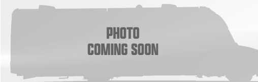
PHOTO COMING SOON