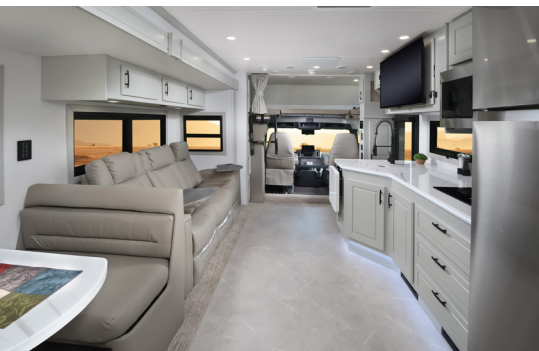
34KD shown with Mindful Gray cabinetry and Milano II décor.