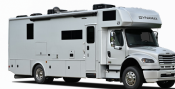
Platinum (Single Color Full Body Paint)