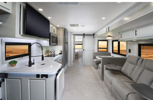
34KD shown with Mindful Gray cabinetry and Milano II décor.