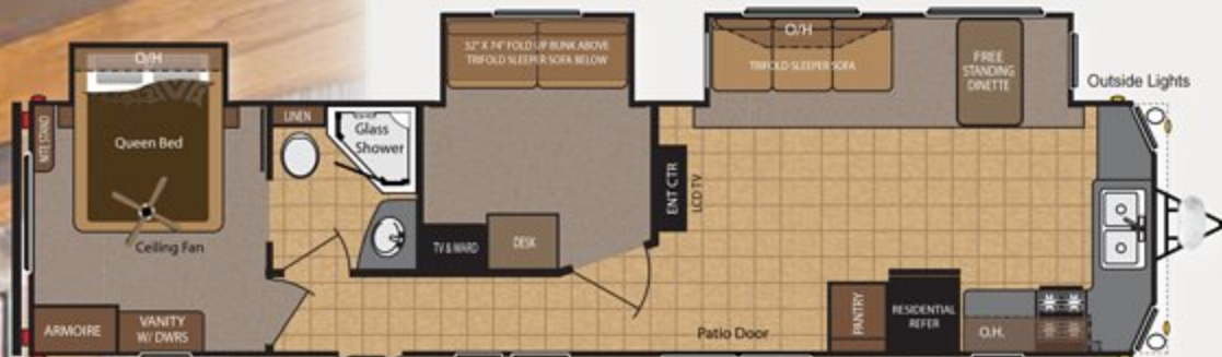
39BHTS SHIPPING WEIGHT: 11,251