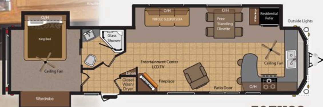
39FKSS SHIPPING WEIGHT: 10,733