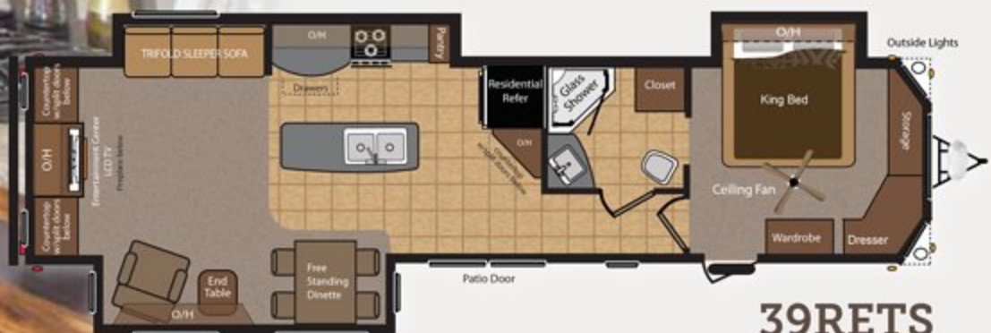
39RETS SHIPPING WEIGHT: 11,331