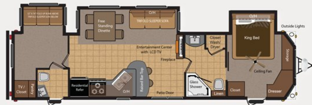
39KBTS SHIPPING WEIGHT: 11,713