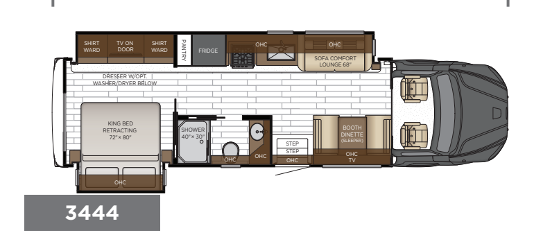
Length: 34' 10"