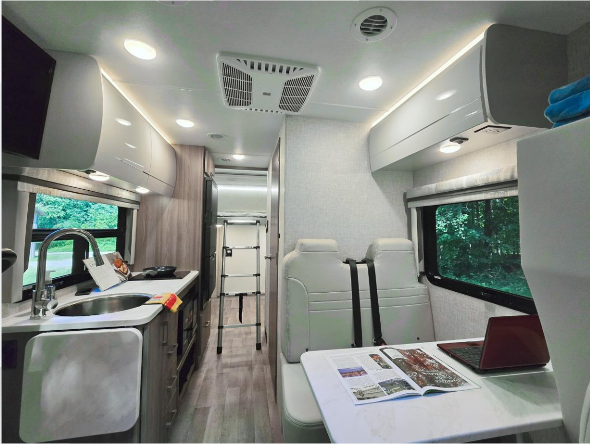
Front-to-Rear view, Note: Queen Size Bed in partially lowered position