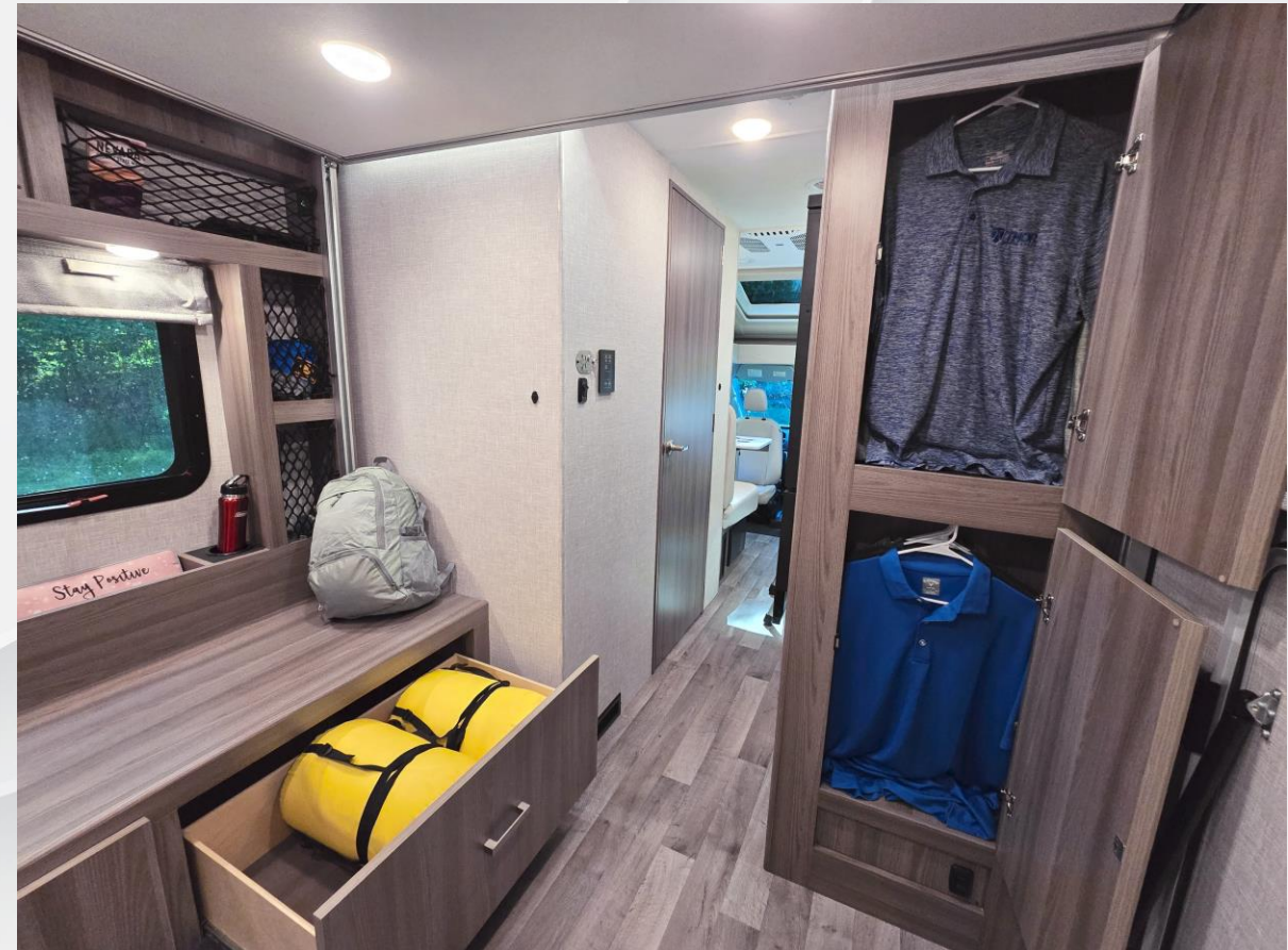
Storage access with bed in raised position