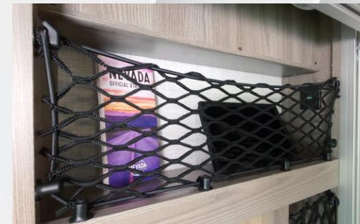
Device charging and storage areas

Bed in partially lowered position; provides good sleeping and storage space