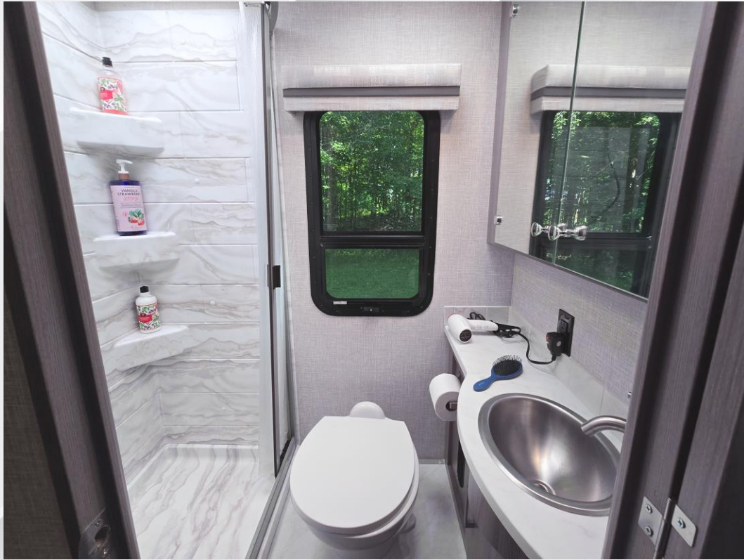
Full-Size and well apported bathroom