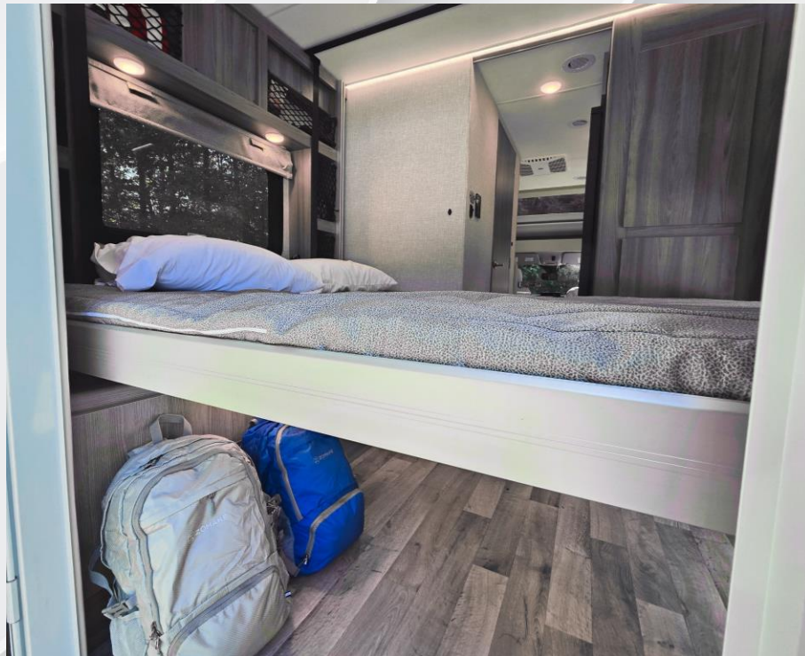
Queen Size Bed in lowered position

Bed in partially lowered position; provides good sleeping and storage space