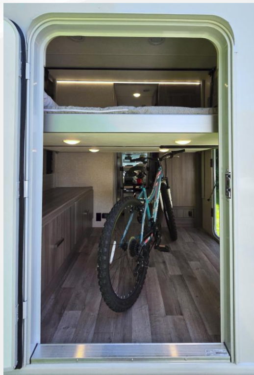
Cargo area with bed in raised position