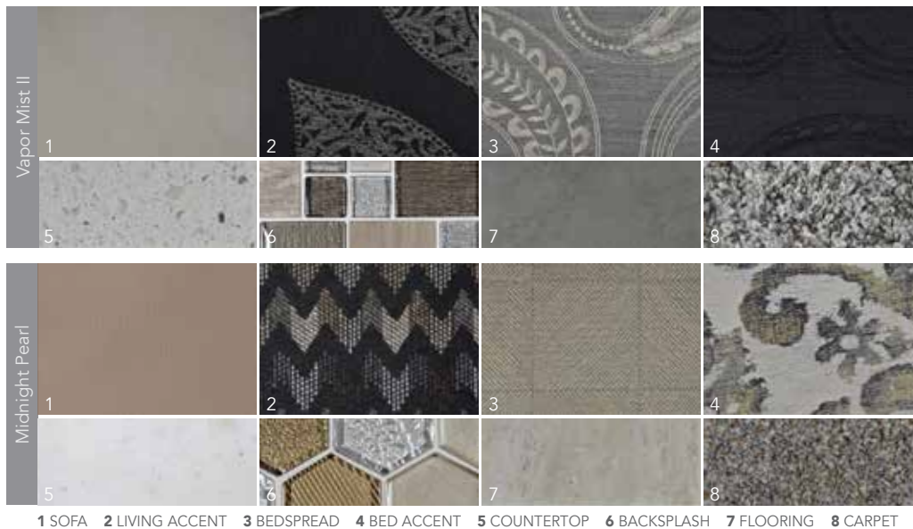
1 SOFA 2 LIVING ACCENT 3 BEDSPREAD 4 BED ACCENT 5 COUNTERTOP 6 BACKSPLASH 7 FLOORING 8 CARPET