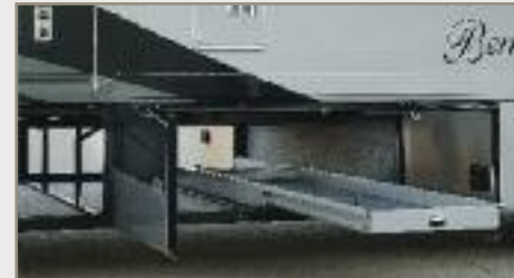
Standard suicide compartment doors with pass-thru storage and optional slide-out storage tray