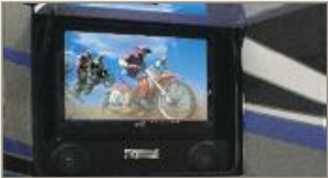
Optional exterior entertainment center in sidewall (N/A 390 RB CSA)