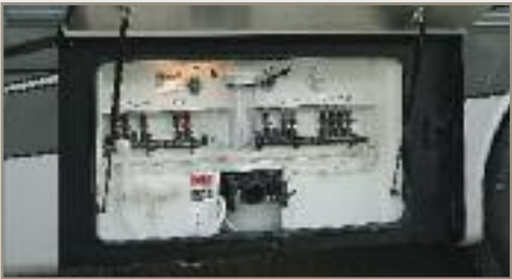
Berkshire water manifold system with whole house filter and exterior shower