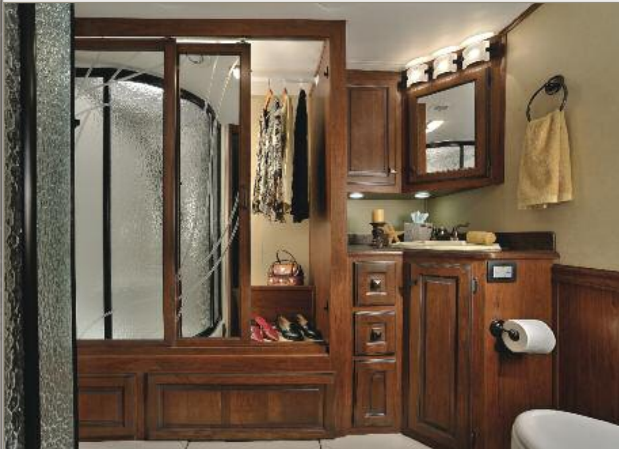
Model 390 RB's luxurious full bath