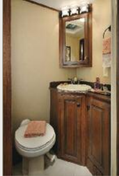
Model 390 RB half bath

Roller style sun and blackout shades throughout the coach enhance privacy.