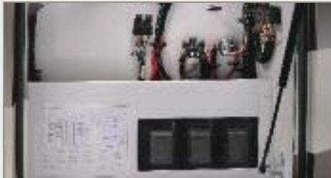
Easily access electrical fuses with Berkshire's no fuss schematic.