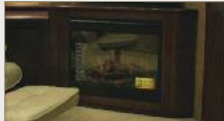
Optional fireplace (N/A 390 BH)