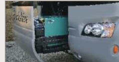
Generator slide tray