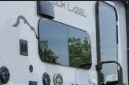
Automotive Frameless Windows Package

Gel Coated Fiberglass, Power Tongue Jack, Aluminum Rims