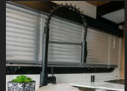
Residential Pullout Faucet