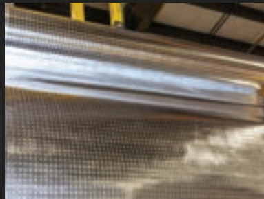
Thermo-Foil Arctic Insulation