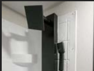
Upgraded Shower Head