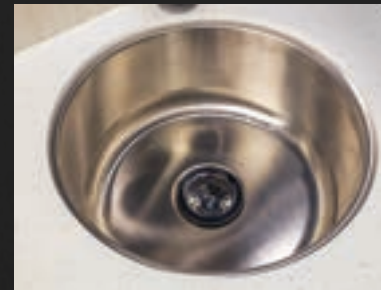
Deep Stainless Steel Sink