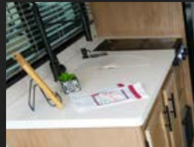
LG Solid Surface Countertop