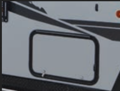
Hands Free Baggage Door Catch