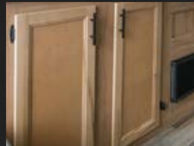
Solid Wood Cabinet Doors