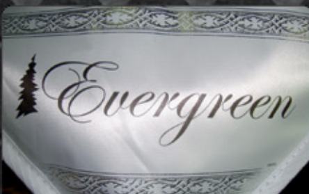
Evergreen Select Foam Mattress