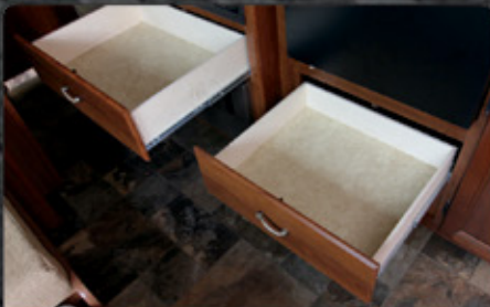
Dual Pots-N-Pans Drawers