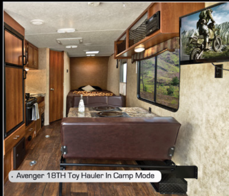
• Avenger 18TH Toy Hauler In Camp Mode