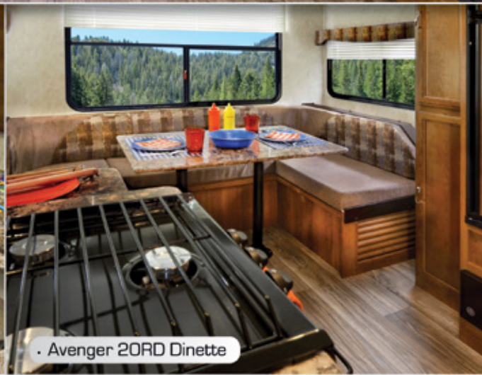
• Avenger 20RD Dinette