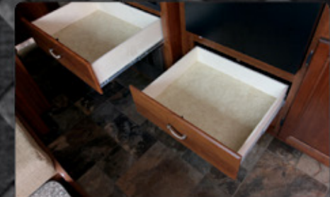
Full Extension Drawer Guides