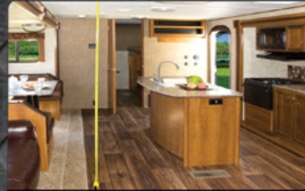
Avenger features 82" Interior height with the MAX Slide at nearly 6 ft. WOW!