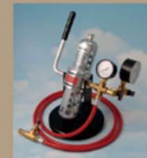
Seek-A-Leak Pressure Test