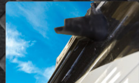
Extended Drip Spouts