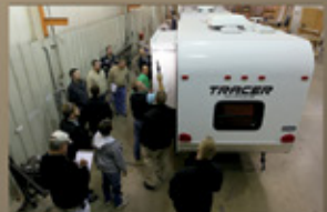
Executive Quality Audits