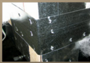
EVERLAST Cross Banded Construction