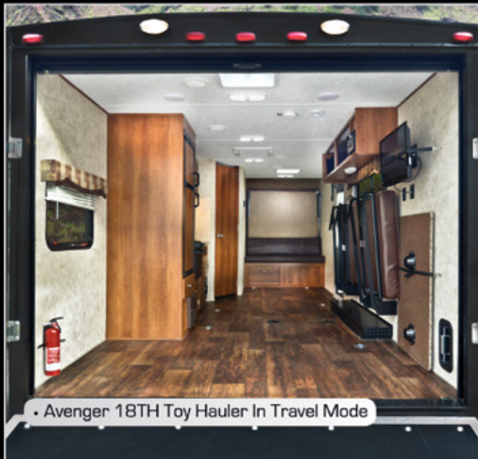
• Avenger 18TH Toy Hauler In Travel Mode