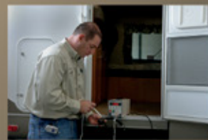
65 Point Secondary PDI