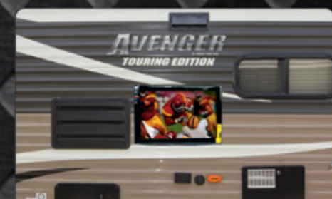
Exterior TV Hook-Ups