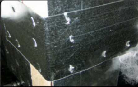
EVERLAST® Cross Banded Construction