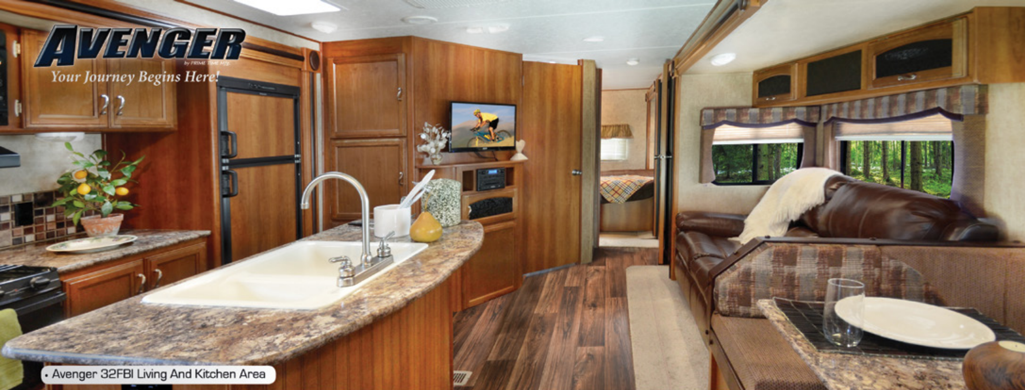
• Avenger 32FBI Living And Kitchen Area

For both the first-time buyer and seasoned camping veteran, the value-conscious Avenger often represents a customer's first experience with a recreational vehicle from Prime Time Manufacturing. Since first impressions are critical - and last a lifetime - we've insisted that Avenger combine comfort, convenience, and style with the industry's highest standard of quality and construction. By providing a GREAT ownership experience, Avenger is Prime Time's way of welcoming you to our family. We hope that your future journeys will always include a Prime Time RV.