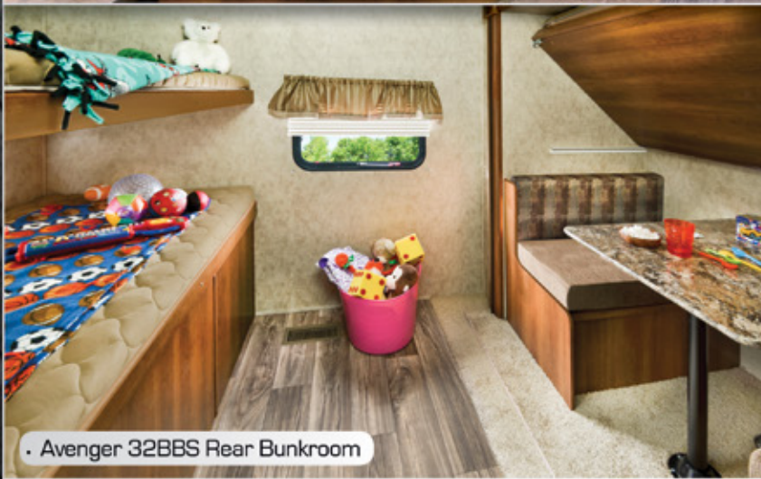
• Avenger 32BBS Rear Bunkroom