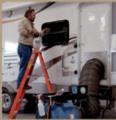
Seal Tech Air Pressure Test

Prime Time Manufacturing is proud to be recognized as an industry leader in value, reliability, and overall quality by the Recreational Vehicle Dealers Association. This was accomplished by committing ourselves to "A Higher Standard" in design, construction, testing, and customer service. Check us out - we know you'll be impressed!