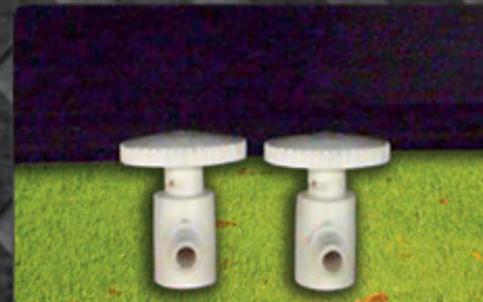
Easy Access Low Point Drains