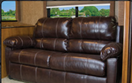
MAX Slide Features a Residential Hide-A-Bed Sofa