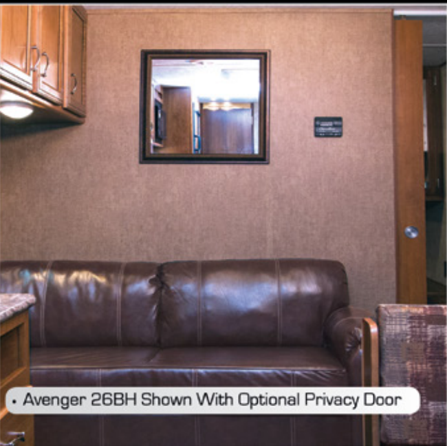
• Avenger 26BH Shown With Optional Privacy Door

To guarantee that Avenger provides true customer satisfaction, our engineers carefully examined every component, every small detail, and every process that went into Avenger's creation. It was important to offer industry-leading beauty, so real Native American Cherry hardwood cabinet doors were paired with premium fabrics, flooring, and countertops for a luxurious appearance. Features and design elements that are considered to be "Best In Class" and rarely found on the competition were specified to fully maximize customer enjoyment. Demanding testing standards and innovative construction technique like EVERLAST® were developed to ensure long-term quality and durability. If "Your Journey Begins Here", Avenger is sure to please.