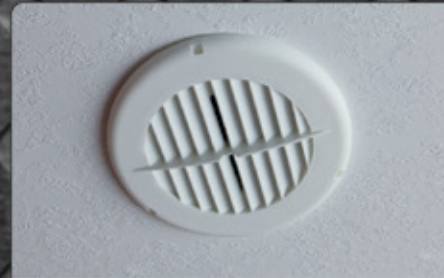
Avenger Has Ducted Heat & Air