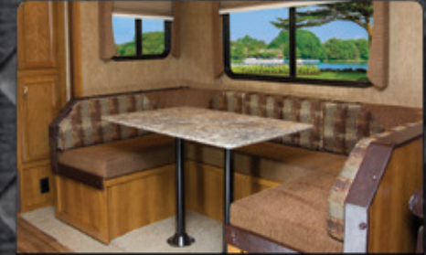
MAX Slide Features an 87" U Dinette