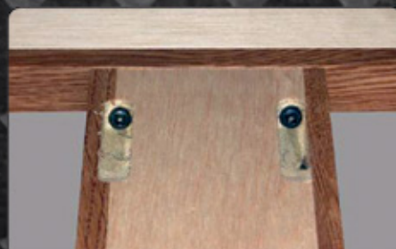
Pocket Screwed Cabinets