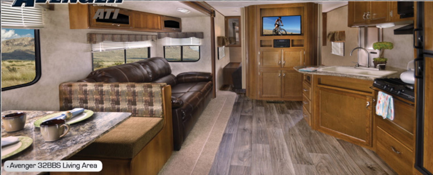
• Avenger 32BBS Living Area