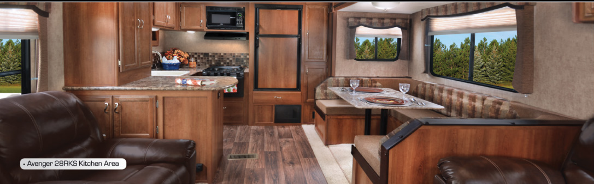
• Avenger 28RKS Kitchen Area

For both the first-time buyer and seasoned camping veteran, the value-conscious Avenger often represents a customer's first experience with a recreational vehicle from Prime Time Manufacturing. Since first impressions are critical - and last a lifetime - we've insisted that Avenger combine comfort, convenience, and style with the industry's highest standard of quality and construction. By providing a GREAT ownership experience, Avenger is Prime Time's way of welcoming you to our family. We hope that your future journeys will always include a Prime Time RV.