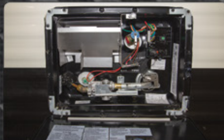
18 Gallon/HR Water Heater Recovery