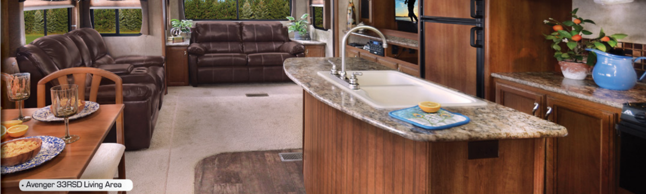
• Avenger 33RSD Living Area

To guarantee that Avenger provides true customer satisfaction, our engineers carefully examined every component, every small detail, and every process that went into Avenger's creation. It was important to offer industry-leading beauty, so real Native American Cherry hardwood cabinet doors were paired with premium fabrics, flooring, and countertops for a luxurious appearance. Features and design elements that are considered to be "Best In Class" and rarely found on the competition were specified to fully maximize customer enjoyment. Demanding testing standards and innovative construction technique like EVERLAST® were developed to ensure long-term quality and durability. If "Your Journey Begins Here", Avenger is sure to please.