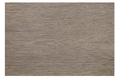
SEAGRASS Matte Finish Tile