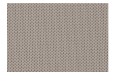
TAUPE HILL (O) NEW