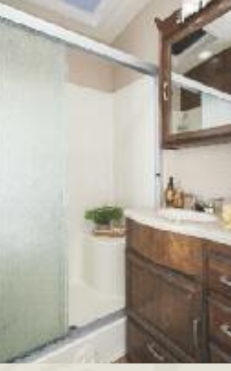
This bathroom features a onepiece fiberglass residential shower with a built-in seat, skylight, large medicine cabinet, solid surface countertop and five drawer hardwood vanity.