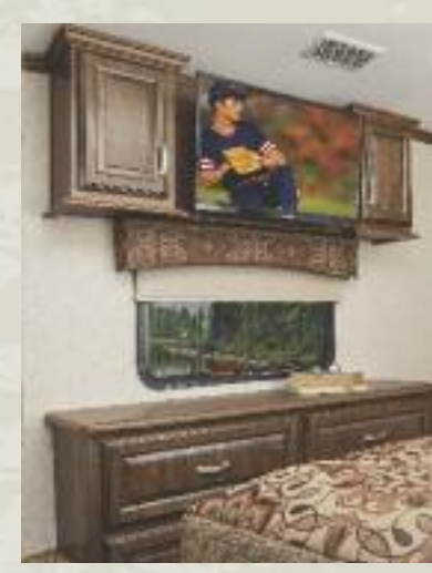
Bedrooms include a 32"LED TV, contemporary, mirrored cedar lined wardrobes and standard washer/dryer prep. (Dual electrical supply allows the washer/dryer to operate simultaneously.)