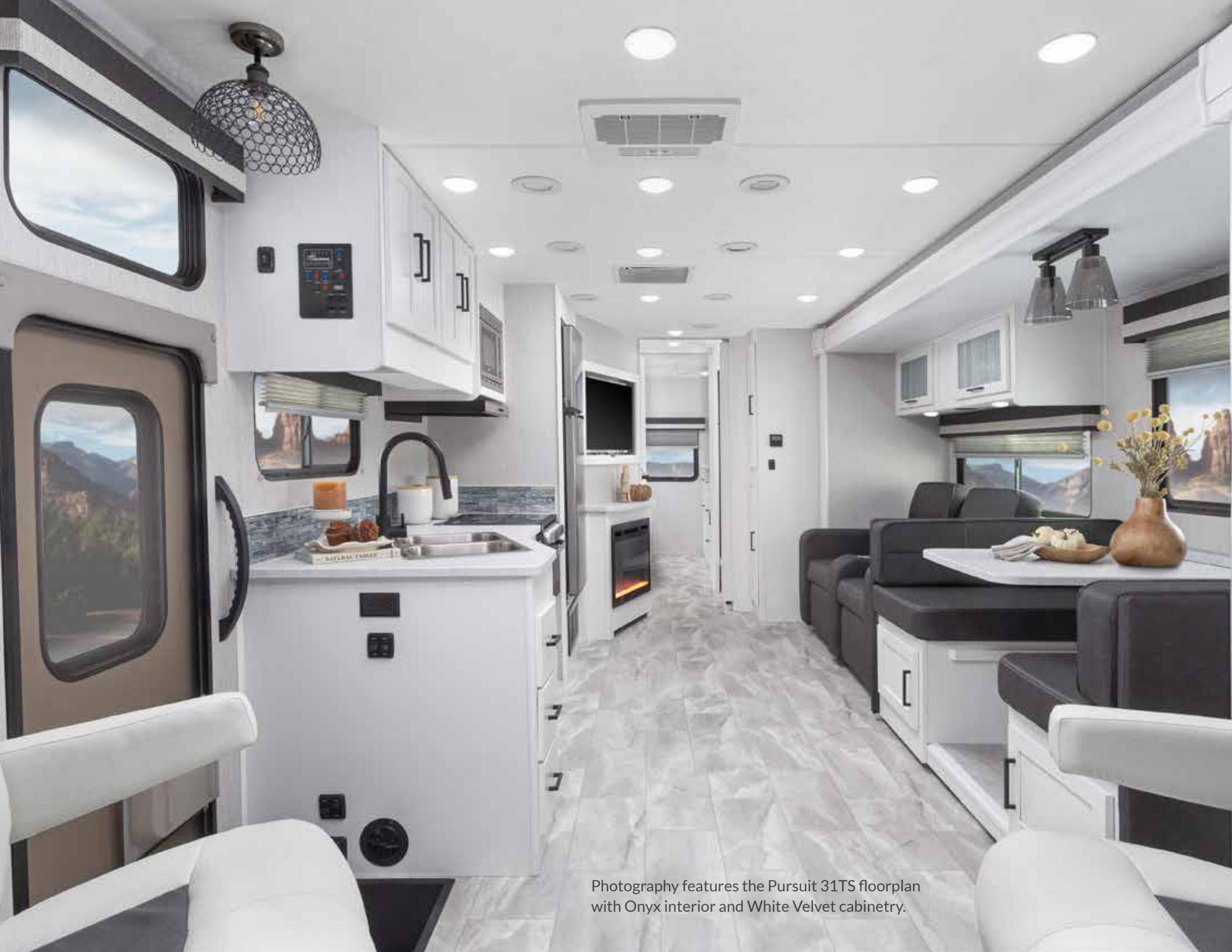
Photography features the Pursuit 31TS floorplan with Onyx interior and White Velvet cabinetry.